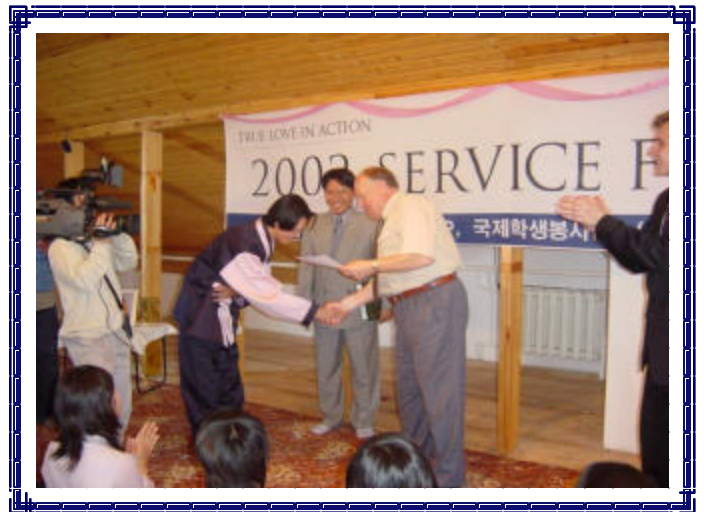
HE Stanislav Shushkevich presents Graduation Certificates