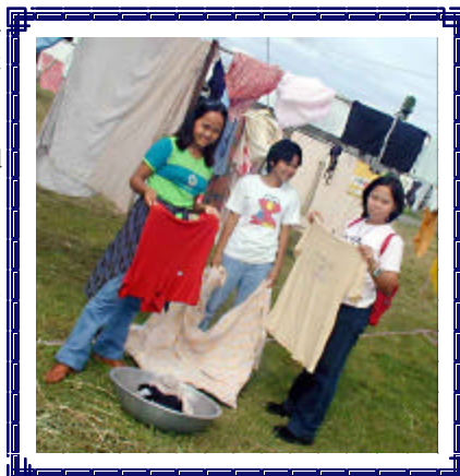
Something different: washing bottles, clothes