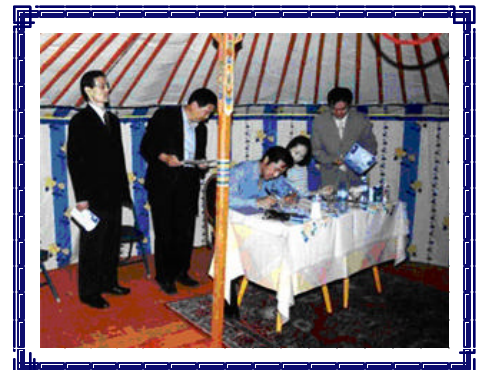
Signing Programs in a traditional Mongolian Tent before the Rally