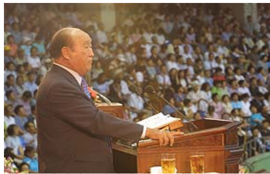
Rev. Sun Myung Moon speaking recently in Korea

Even the animals spit at homosexuality and free sex. The animals feel such people are dirty. You shouldn't contaminate your entire body or any of the organs. You young people, keep protecting your body as a pure sacred body, all the way to the point that you marry. If you can keep this promise, and reach that moment of the blessing, God will protect your marriage and you will have abundant blessing in your life.