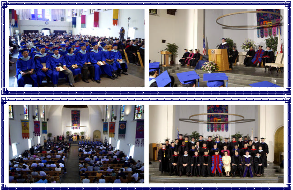
Scenes from the Graduation Exercises at the Unification Theological Seminary.