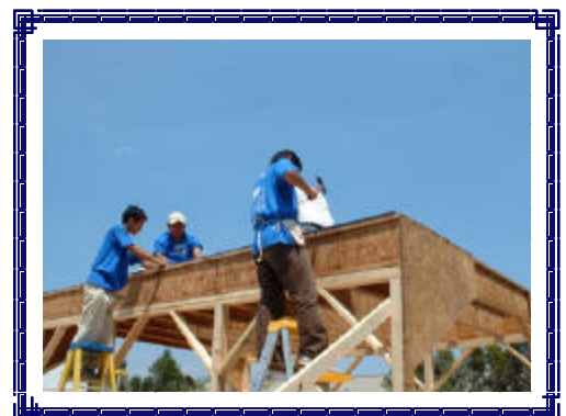
Building a Shed in Norfolk, Virginia