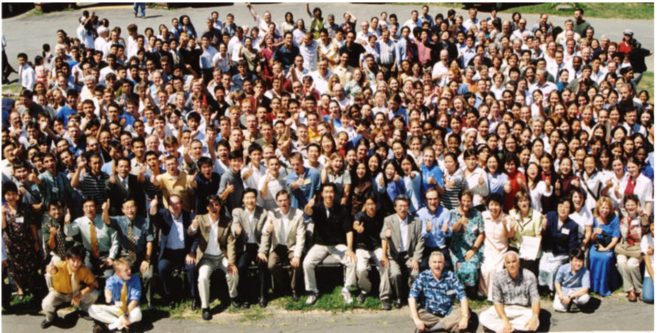
The 2002 STF, Staff and Parents with Hyun Jin Nim at UTS

materialistic world?. I think this is the best way. It is profoundly educational. The spiritual world becomes part of your daily life and you see how it works. With that kind of daily experience, you cannot help but live for the sake of others, challenging your limitations every day. This is how to grow and mature and become wiser in recognizing your relationship to God's providence.