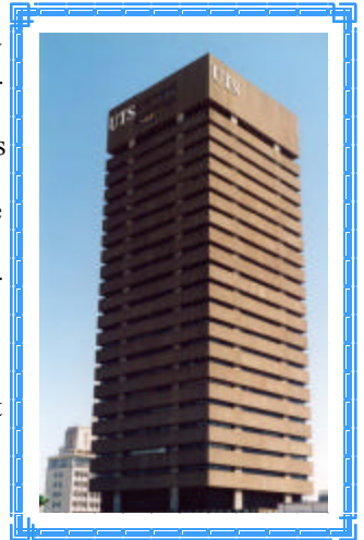
The 'other' UTS

The second event was a display for high school graduates to see what the University has to offer. This was an interesting event for two reasons. First was the amazing turnout, over 10,000 students from all over the country came.