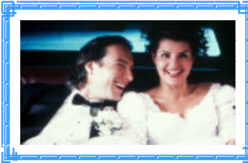
John Corbett and Nia Vardalos convincingly in love.

Maybe we live in an age where the barriers really are coming down and international and interracial marriage may soon become the rule, not the exception.