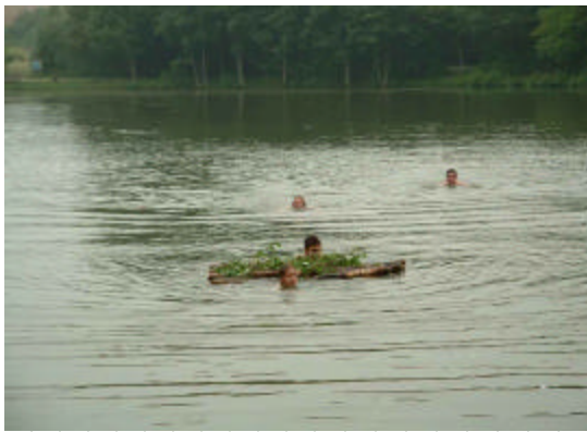
This does look kind of fun, if you survive...