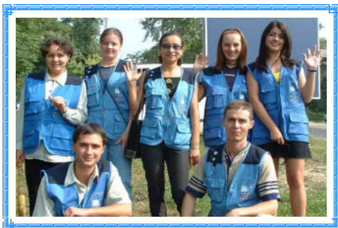
Moldova SFP Volunteers mark Independence Day with service