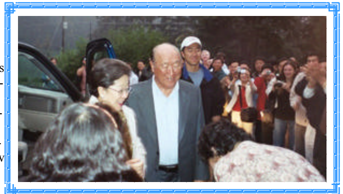
True Mother returns from Japan at the end of the workshop

Then we would celebrate until four in the morning when Father would announce with a big happy