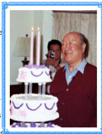
Each night, Father celebrated with CARP Leaders in Kodiak

We have received God's love yet we are not in the position to receive this love directly, only indirectly. However, in order to receive God's direct love, we must have our country. Why is this so? Because Satan and the Satanic world still remain. We have to excel. You have to know for sure and understand that this is the path we must follow.