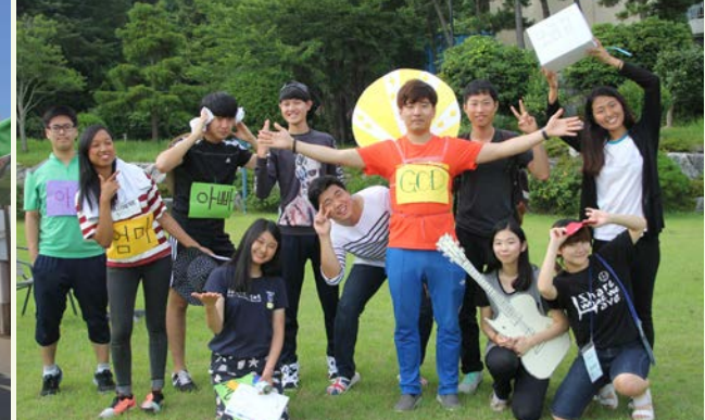
Workshop participants taking part in team projects