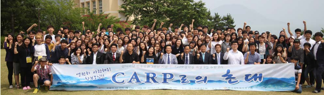
Participants making resolutions to successfully hold the Third Universal Seonghwa Memorial during their 2nd summer vacation workshop held by CARP-Kor