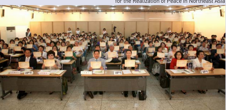
Group photos taken after everyone signed the petition