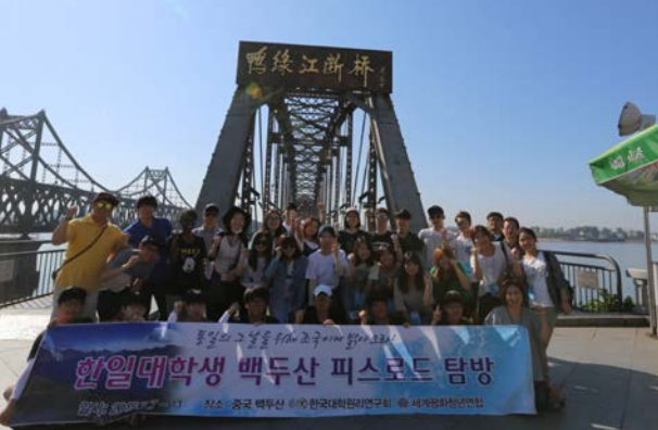
Photos taken at the Yalu River railroad bridge by CARP exploring team of Mt. Baekdu