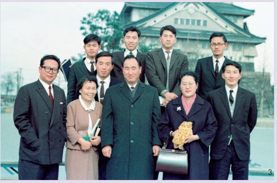
Day of Hope banquet held in Tokyo on February 1972 True Father speaking at a members' rally held in Saitama 1965 – After choosing a holy ground, True Father took this commemorative photo with Japanese leaders that were with him.