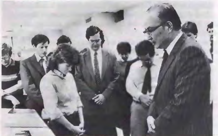
Prayer after finishing the first issue.