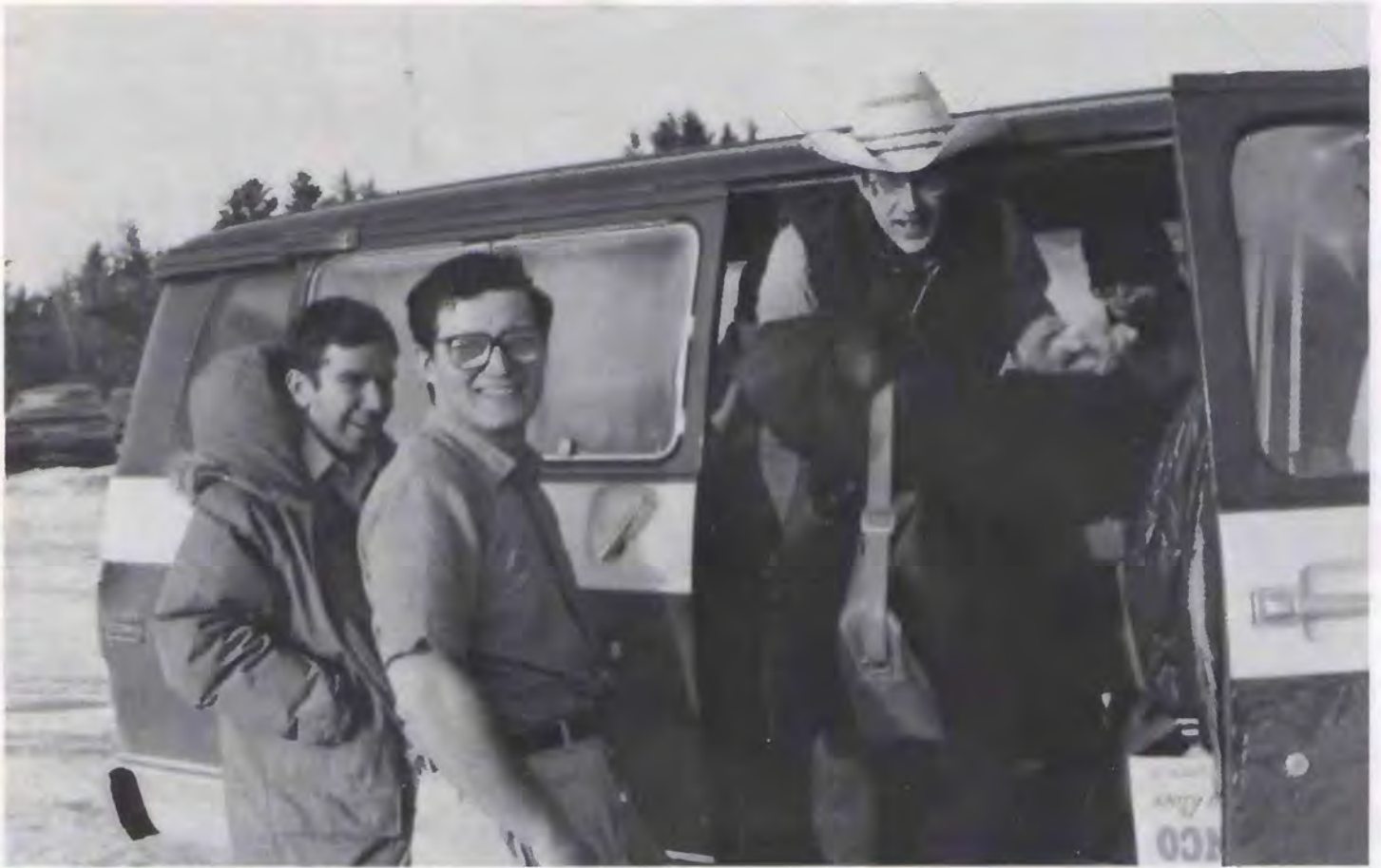
Changing drivers on the road.