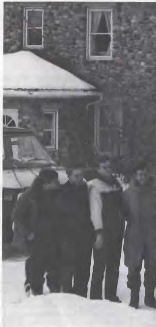
The official campaign send-off photo, February 21,