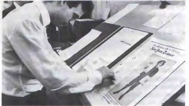
Ads for the Tribune feature a delivery boy dressed in 19th-century style.