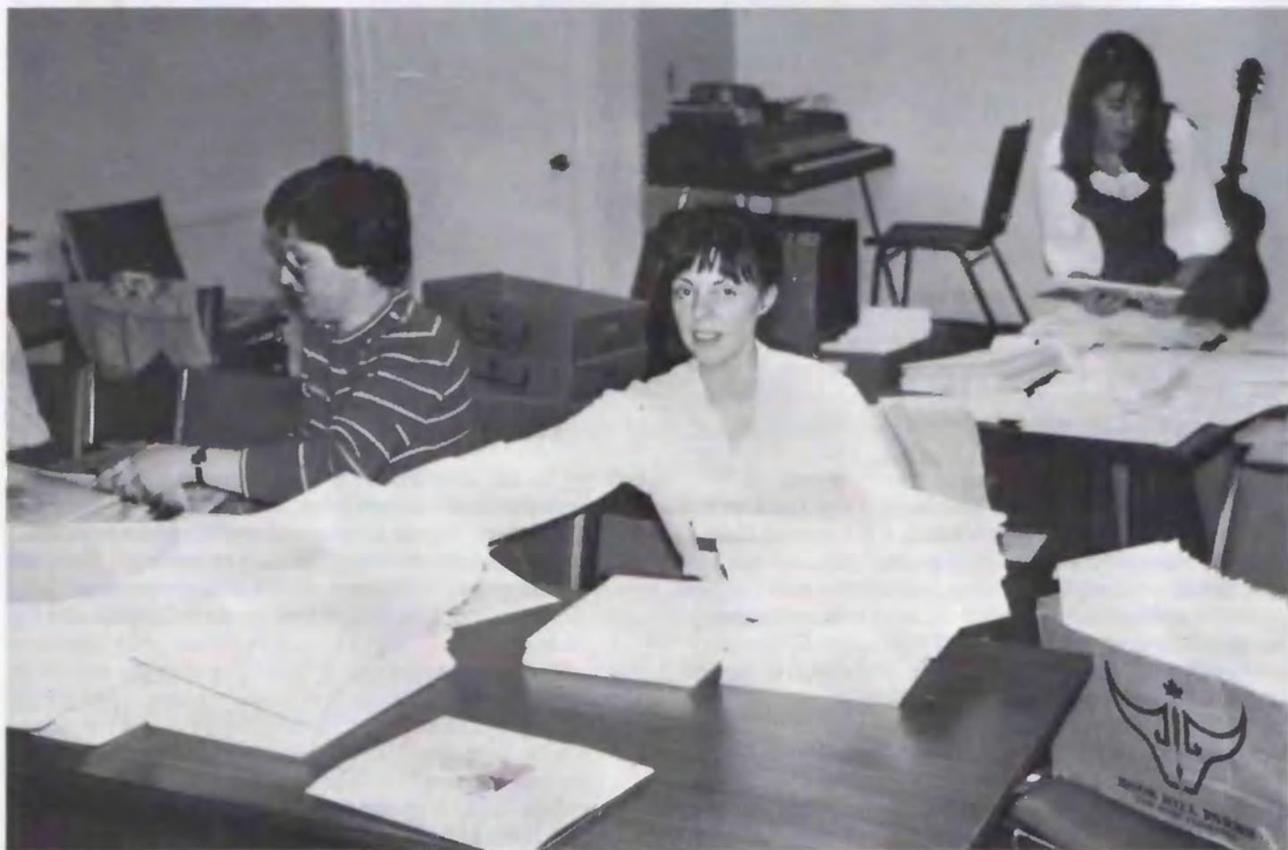
Mailing out public relations packages from the Toronto headquarters.