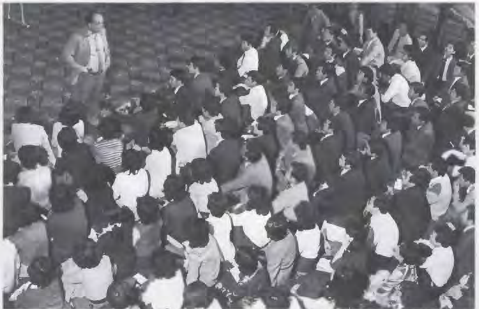
In January, Father called the Japanese members working in the United States to New York and sent many of them out witnessing.