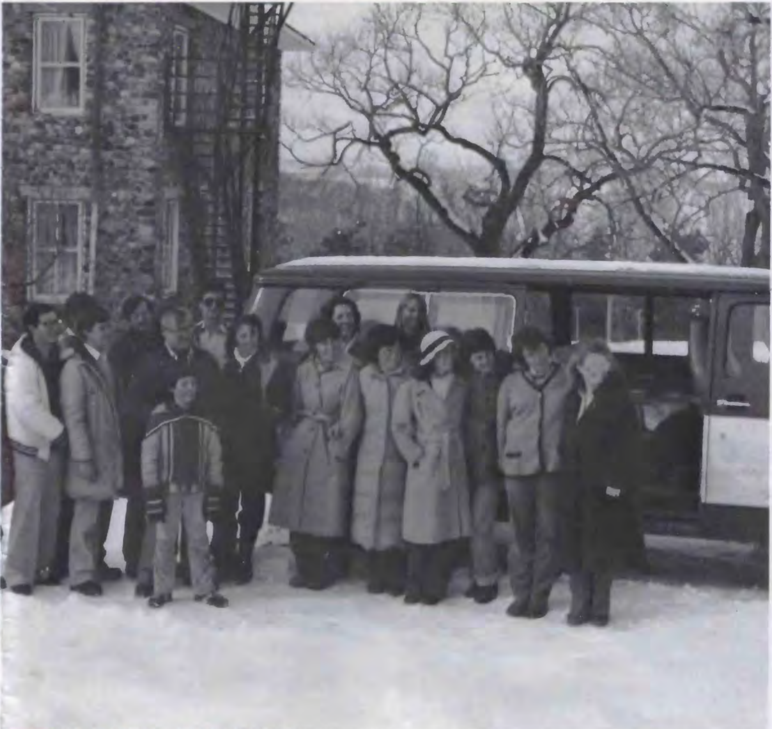
1982, in front of the Canadian family's retreat house.

the incredible blessings that God has granted our nation—its breathtaking beauty, bountiful resources, and youthful vitality—to help her develop into a nation capable of taking global responsibility.