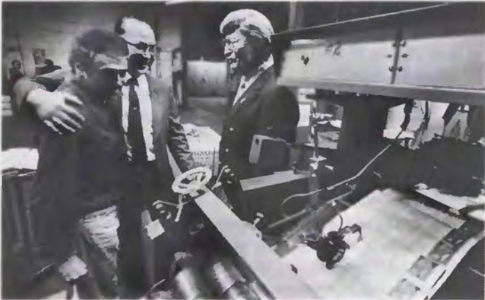
The New York Tribune rolls off the presses in Belleville, New Jersey.