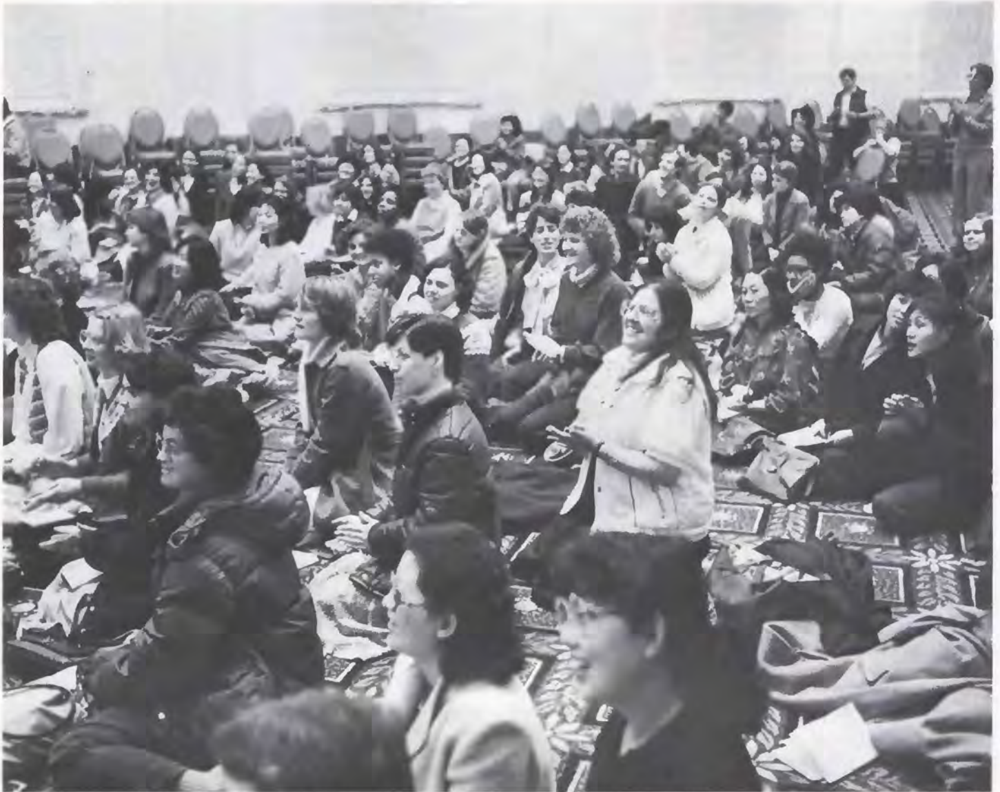
Prior to departure for IOWC, the sisters gathered in the Grand Ballroom for a final meeting.