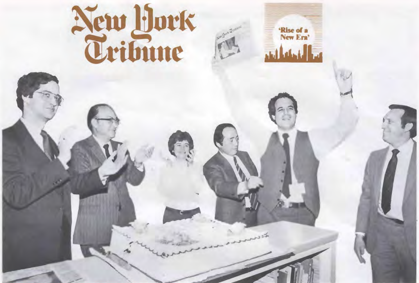
Cake and a party celebrate the birth of the new newspaper.

The following short article appeared on the front page of the first issue of the New York Tribune, April 4, 1983, which replaces the News World.