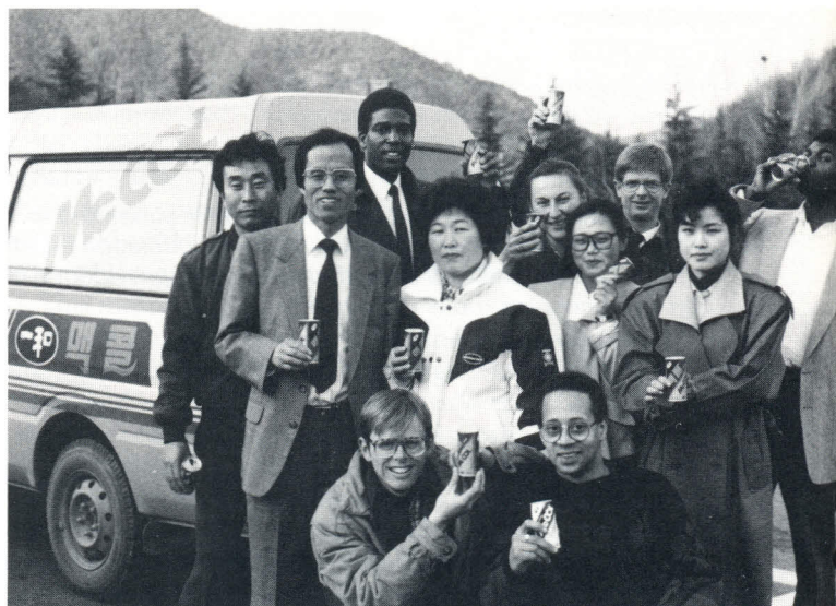
Enjoying McCol after a mountain walk.

church elders was when she did something wrong—then they would scold her. In her dreams Korean soldiers would attack her with knives and try to kill her. But she would say, "Don't kill me; I have to pay this indemnity." She prayed for the liberation of those who were resentful to her and to Japan. After six years she was victorious. Now she helps others in similar situations. She feels responsible