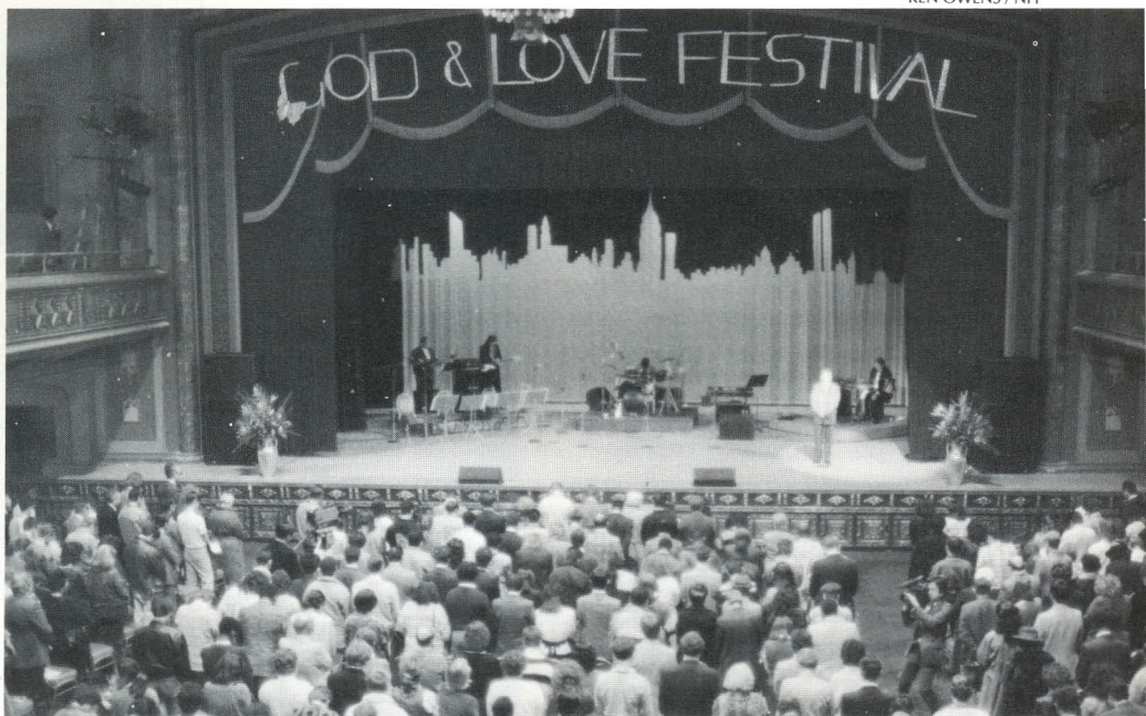
Uplifting musical performances inspire the audience—a distinctive New York skyline enhances the background.