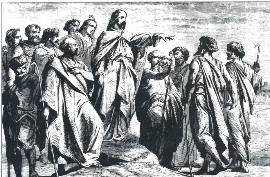
Jesus sending forth the apostles to witness in surrounding towns.

first, "You, Devil, do you agree?" Satan said, "Yes," even though he didn't like it. With this condition God gave permission to Father to give his victory to his