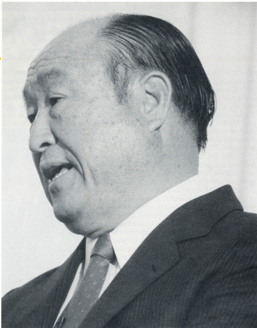
S. K. DESLAURIERS / NFP

Before the 24th Olympics closed in Korea, I announced another "heavenly Olympics," called the World Festival of Culture. The finest youth of the world shall come and eventually be blessed by the True Parents. There are three levels of bless-