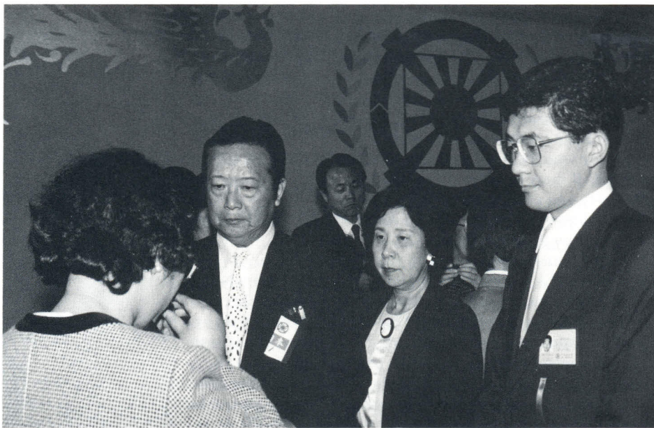
A couple receiving the Holy Wine.

When we receive the Blessing from True Parents, there are four points that we pledge. Only through fulfilling these will our blessing become eternal. The Blessing which God gave to Adam and Eve was also a conditional blessing. The