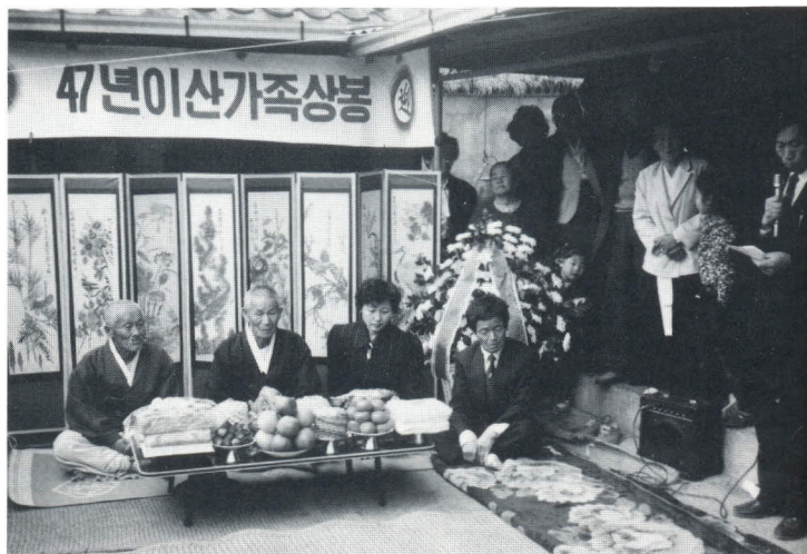
Commemoration ceremony for 47 years separation of North and South Korea.

Noon was lunch time, and in the afternoon we went out getting subscrip-