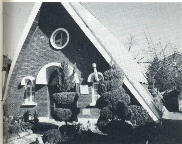
Beautiful A-Frame churches have been constructed around the country.

When the mobilization staff went to a concert in Seoul, we noticed that most