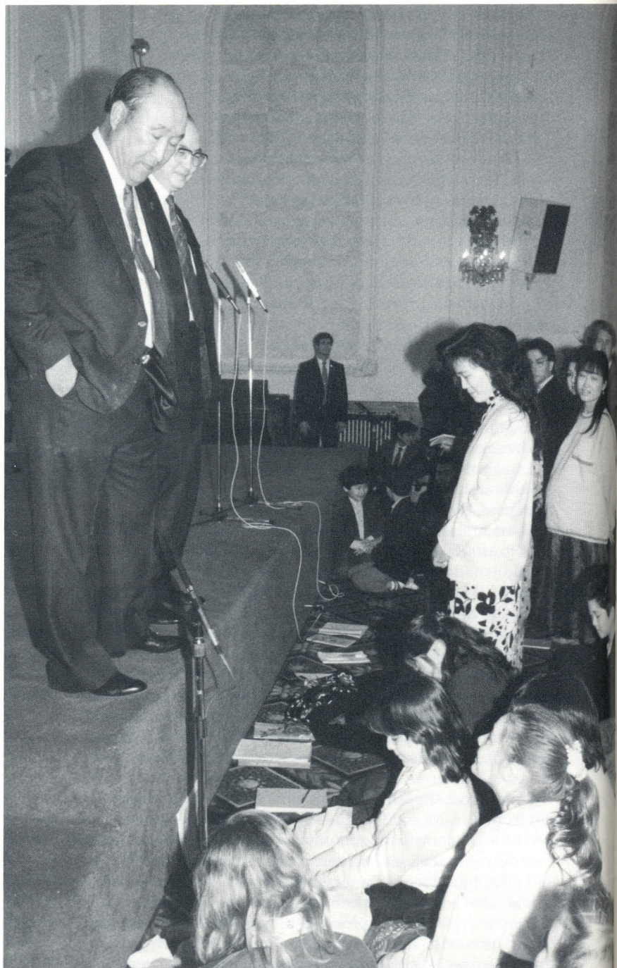
Father speaks to the blessed children.

What is the formula for multiplication? The Blessing is the