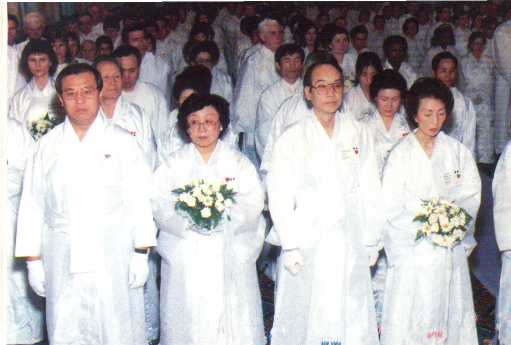
Ceremony for the 138 Couples Blessing and the 57 Members Single Blessing.