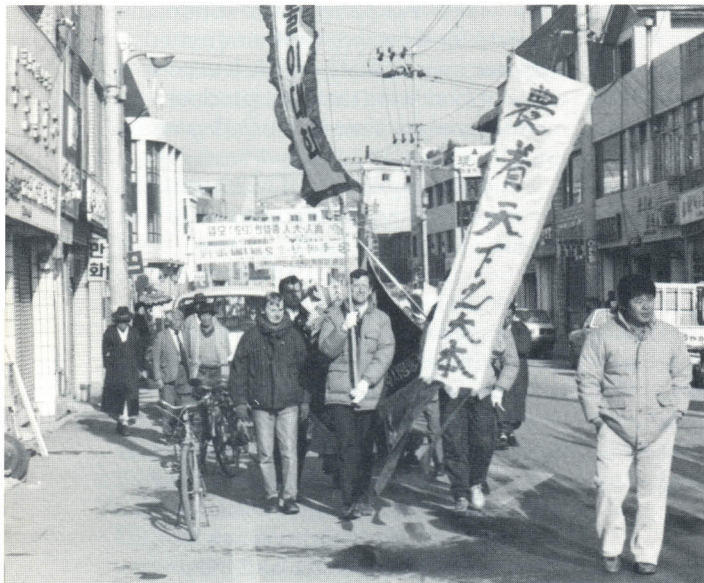
Several members participate in a city parade.

Perhaps my words are a bit premature, but I am seriously dedicated to love you with God's true love. First because we absolutely must not be a source of pain and sorrow to God when He looks upon us. We must live to inspire True Parents, and all our brothers and sisters, by an example of deeply