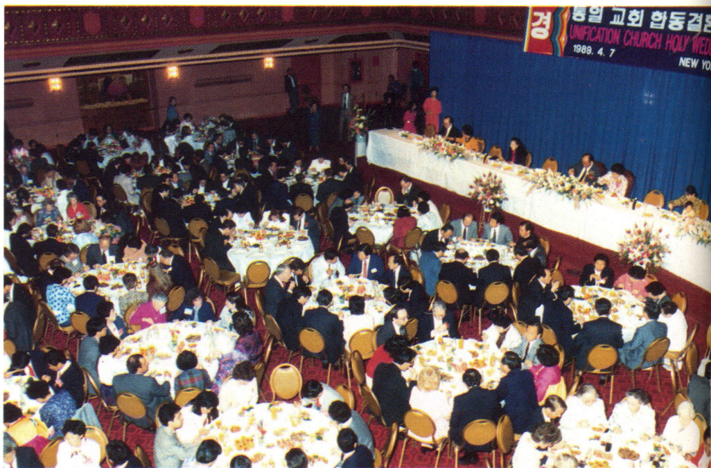
Evening dinner and entertainment for the newly blessed couples.

As the grand finale, Father and Mother came to the stage. It was so touching to see their true give and take as they sang four songs and joyfully danced, inviting everyone to join in. It was such a heavenly atmosphere—I felt Father's tremendous love and desire to give the newly blessed members a substantial taste of heaven, something that they could carry throughout their blessed lives and through any of the challenges they may experience. □