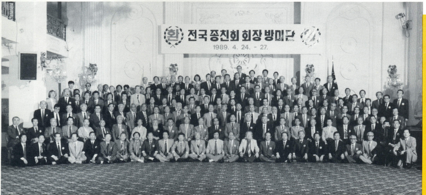
Members of the Korean Family Clan Chairmen's Association pose for a group picture in the Grand Ballroom of the World Mission Center.