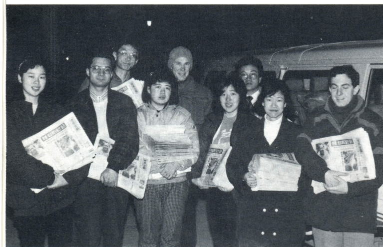
A Segye Ilbo 3 a.m. delivery team.

In the town of Kumi, I met another of our elder sisters. She has been a member since the late 1950's. She is slightly bent over but everyday she passes out