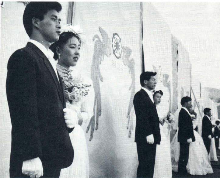
6516 Couples Blessing, October 30, 1988.

I would like to share one thing about the True Family. Father had to always take care of the church members, so most of the time he was absent from his family and home. Even when he was at home, many national leaders came seeking advice from him. Because of this he could not have personal time with his own children. One day Father had a meeting in the New Yorker Hotel, so he had to leave the house late at night. His newborn baby was not yet 40 days old and Father wanted to have time with him. When he was about to leave the house Father spoke to the baby from the front door. Of course the baby couldn't understand, but Father reported to the baby: "I feel very sorry that I can't have time with you. But members are waiting to receive my words, so I have to go there; please understand my situation and forgive me." □