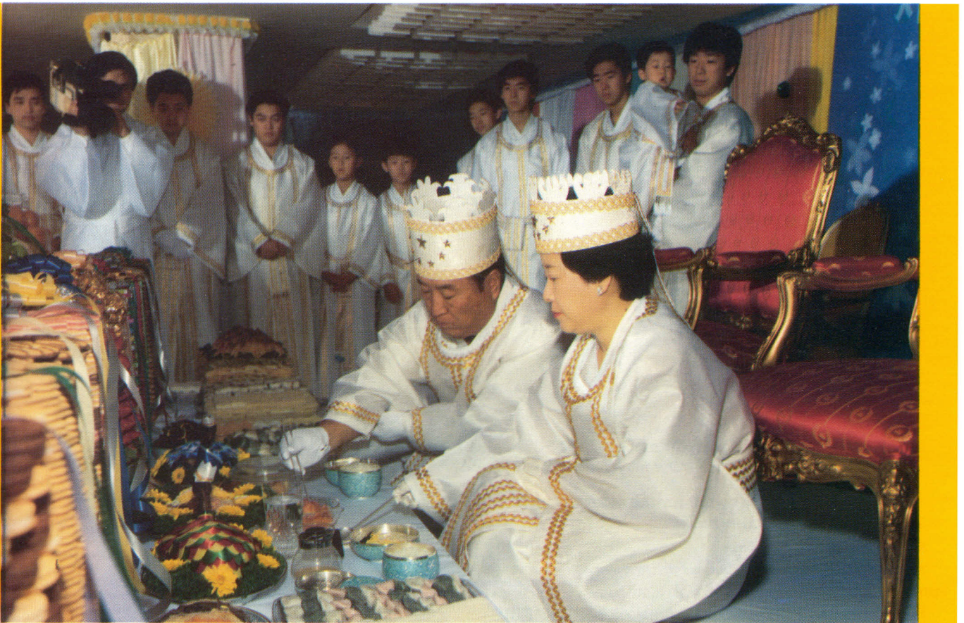
True Parents partake of a specially prepared meal from the Parents' Day offering table.

God is almighty and omnipresent. But what is the one thing that is essential to almighty God? God needs a love relationship with the creation in order to feel joy and stimulation. No matter how almighty He is, God cannot feel joy by