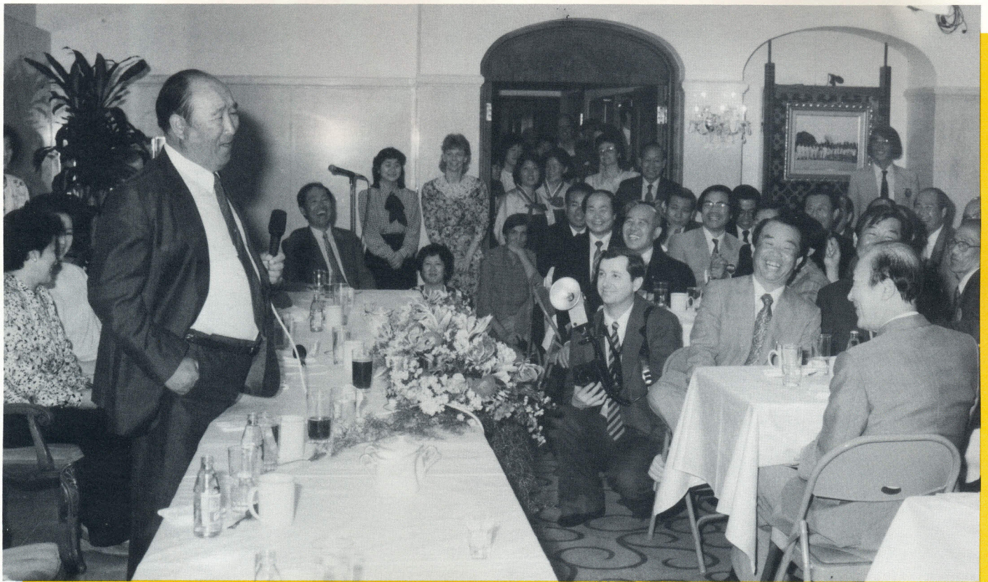
Father addresses the Korean Family Clan Chairmen's Association, creating a warm, family atmosphere at the dinner hosted by True Parents at East Garden on April 25, 1989.