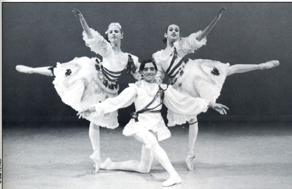
UBA students perform in the "Nutcracker" Pas de Trois.