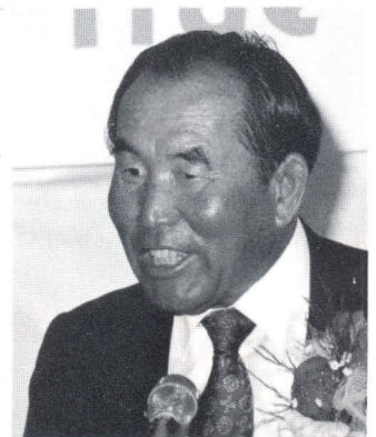
Elder Young Sun Moon