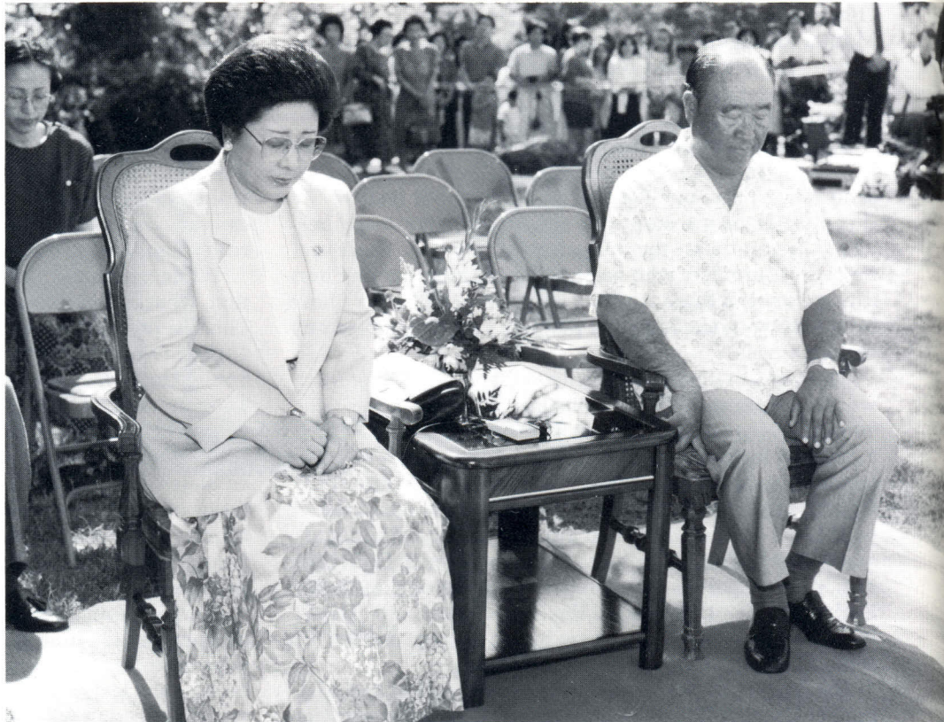
True Parents pray before Father begins speaking to over two thousand brothers and sisters gathered at Belvedere.

Have you heard about the Inquisition book? It tells what actually happened during Father's trial, proclaiming the truth about how the United States government conspired to put Father into jail. Yet, while he was on trial Father created projects like The Washington Times and Insight magazine, The World & I , and so on, in order to save America. I