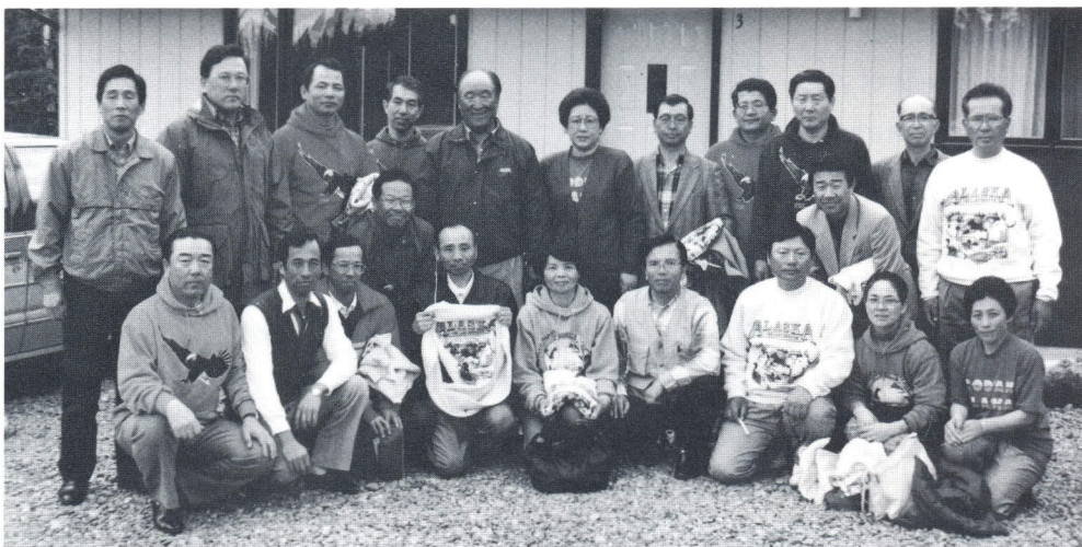
Father invited Japanese leaders who had fulfilled their goals to fish with True Parents in Alaska.

The sun rises at 4:30 a.m. and sets at 11:30 p.m. during the Alaskan summer; usually Father goes to the ocean before sunrise and returns after sunset. He stays on the water about nineteen hours; it's very hard. So Father is all