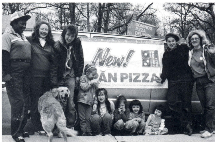
Volunteers clear trash from five public areas and enjoy pizza donated by a local merchant afterwards.