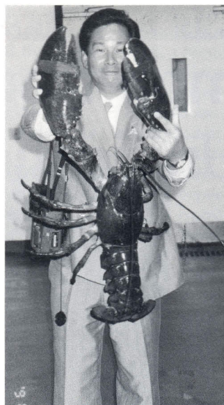
Giant lobsters captivate visitors at the New York Fish House.