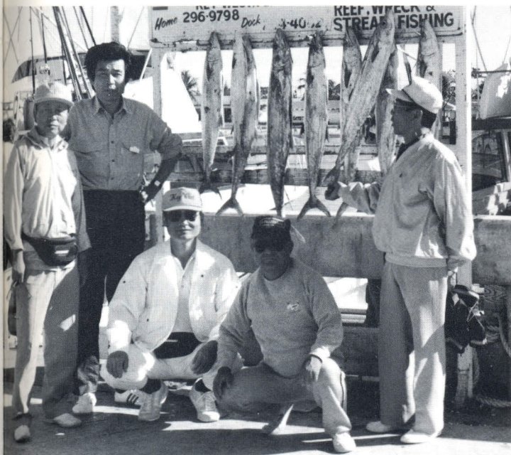
In Key West, Florida, participants pose with their catch of barracuda.