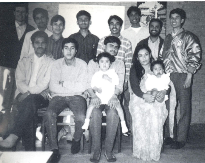
Nepalese members attend a 40-day workshop in March 1991.

such an intense feeling just to see True Parents' picture in the prayer room.