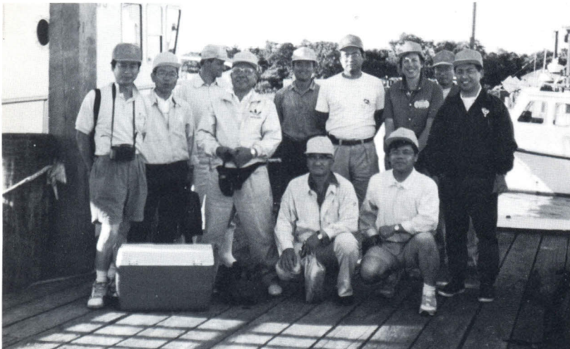
Tour participants are jubilant after a day's fishing on the First Hope II.

Because these thirty Ocean Church centers symbolize such far-reaching consequences, the Eve nation's support in their development is very important. Japan has ties to the sea that go back thousands of years. Because it is an island, Japan has consummated a total relationship with the sea. Seafood is the main aspect of the Japanese diet. Did you know a Japanese chef can pre-