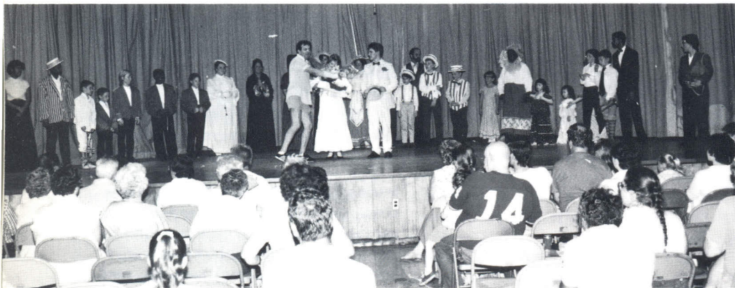
Curtain call for the West Lanham Hills Players production, "The Music Man."

thing to do. It became survival, or insurance, for my family.