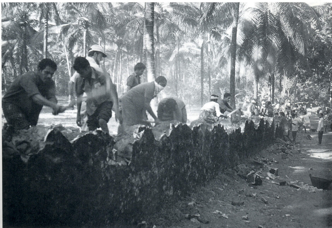
The work portion of RYS began with the goal of widening 1.2 km. of road.