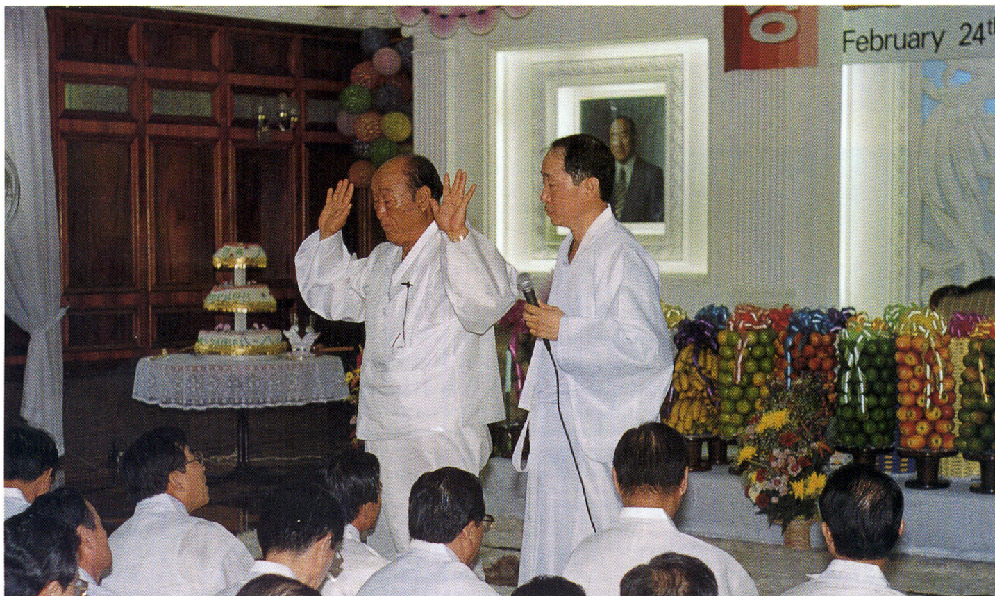
Father speaks to the leaders after the Pledge Service on True Parents' Birthday.

I am declaring a significant point today. The number 76, which is the age I reach this morning, divided by four equals 19. Nineteen is just one number short of 20. Thus, these four years prior to the year 2000 are the most critical providential time period, because they will consummate God's entire providence. From now on, major Unification Church holidays will