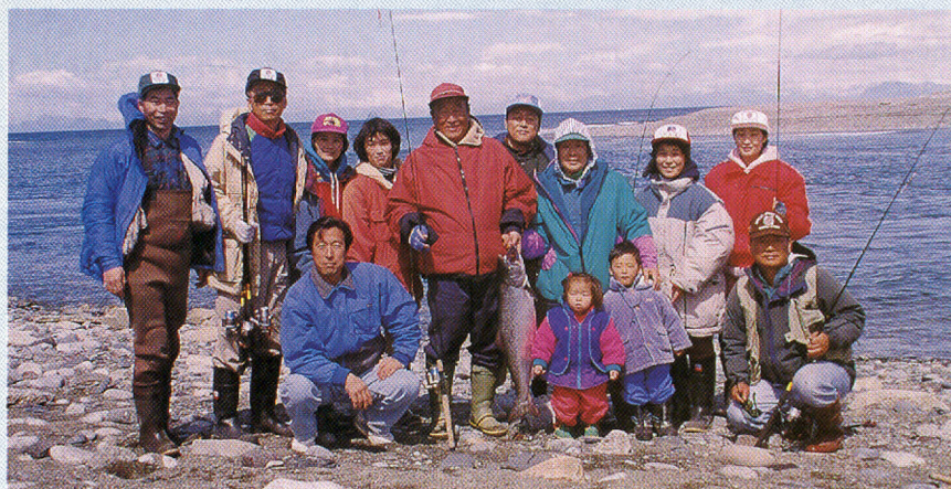
Above: Members of the True Family take a group photo with leaders. Center: On True Day of All Things Father and Mother enjoy an outdoor lunch.

"The process of God's creation was centered on love; all things long for human love and human beings long for God's love. Even when a salmon gets caught and sheds blood, it rejoices because it can be assimilated into the higher human love."