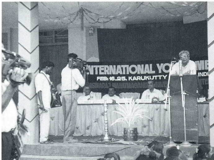
Kerala's governor P. Sivasankar addresses the RYS opening rally.

these programs were designed to help participants clarify norms and their vision of living in an interfaith community. During this time leadership and communication skills were worked on as well as responsibilities delegated. Eight teams were formed, providing a more intimate forum to conduct discussions, practice for cultural programs, and build work teams. Following the orientation, the work portion of RYS began with a goal of widening 1.2 km. of road. Many consider literacy, roads and infrastructure as integral