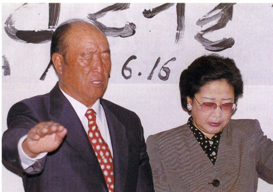
True Parents' prayer for the 34th True Day of All Things in Karluk, Alaska. June 16, 1996.

I urge you one thing: the media and even our own members criticize True Children, but please do not do it. True Parents' victorious foundation is historical; they solved in one stroke, with one proclamation and benediction, the original sin of 720,000 people.