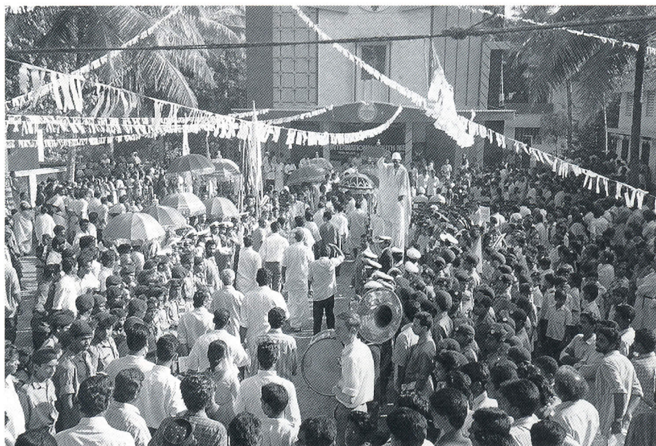
Over 5,000 gather at the opening RYS rally.