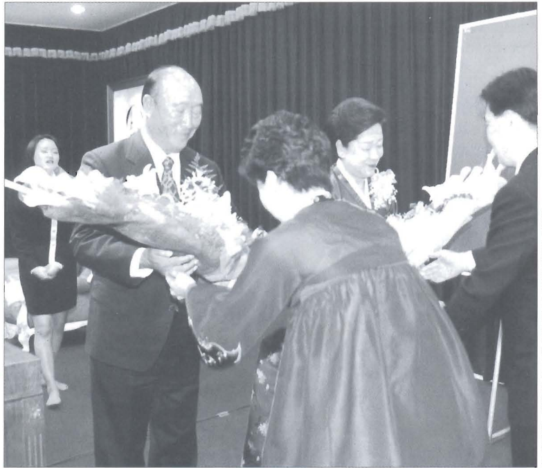
Flowers are presented to True Parents prior to Father's speech on True Parents Birthday.

I do not know whether some provincial governors have come today or not, but such people usually try to establish their authority. They tell others, "You must do what I say." They are very commanding. They do not realize that this is the fallen world. In regards to the daily life you have been living, does your body pull your mind around or does your mind pull your body around? This is the issue. Why does the body drag the mind around? What made it that way? We have not realized that it was because of the fall. We did not know about the fall. People who do not know about the fall cannot know about salvation. They do not think they are in need of salvation. People who do not know they have a disease do not think they need any treatment. Isn't it like that these days? It is the same as with something like cancer. People go along calmly for three or four years without knowing they have it, and then they die. Today, due to the human fall,