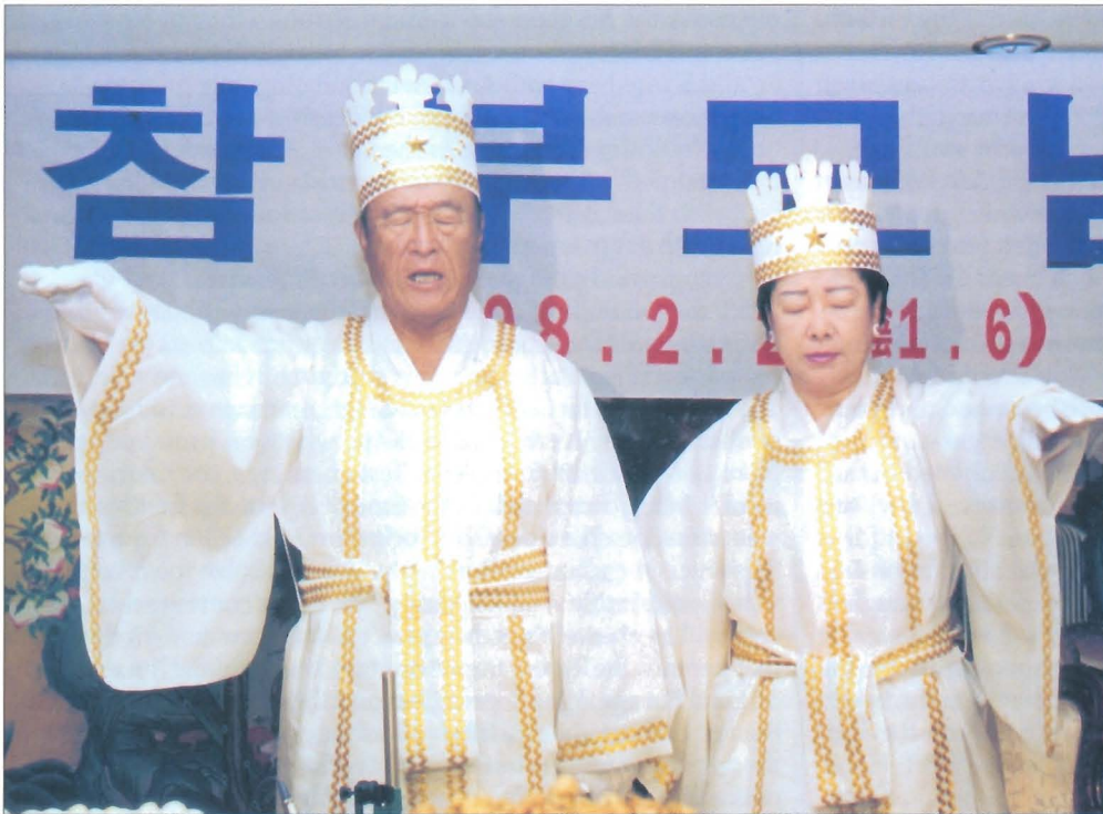
Prayer at Pledge Service on True Parents Birthday.

Therefore, Eve, the women, killed the third Messiah also, Reverend Moon. Christianity, as the bride on the world domain, exiled Reverend Moon. For this reason, through a course of 40 years in the wilderness, a second landing place was restored. This time now is representing the completion of the foundation of blessed couples worldwide 40 years ago, during the