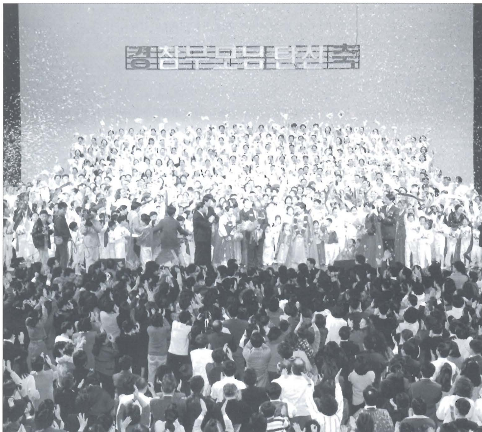
True Parents' Birthday Celebration in Seoul, Korea, on February 2, 1998.

I could not forget this land of Korea, which is to become the homeland, and I have come here again, Father. Now that I have come, You know the unspeakable things that are here. Thus I could not help but begin to hold the Hoon Dok Hae in order to tie together a foundation of heart. This is the homeland with which I have an eternal relationship, such that if I cannot live here in the Kingdom of God on earth, I will live here in the eternal Kingdom of God. Therefore, I came here and began the Hoon Dok Hae. Today the national messiahs from every nation of the world have gathered here to celebrate True Parents' Birthday. Leaders of the people and representatives of important organizations have also gathered together here. Heaven,