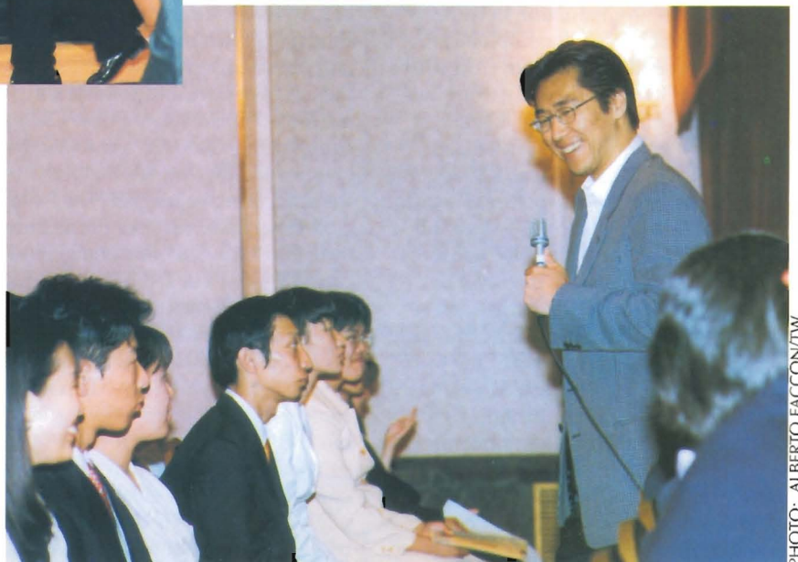
Hyun Jin Nim gives internal guidance to newly matched second generation couples on the day before the Blessing ceremony.