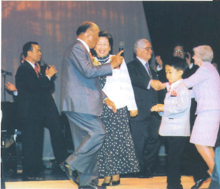
True Parents and guests dance on stage at the close of the ceremony.