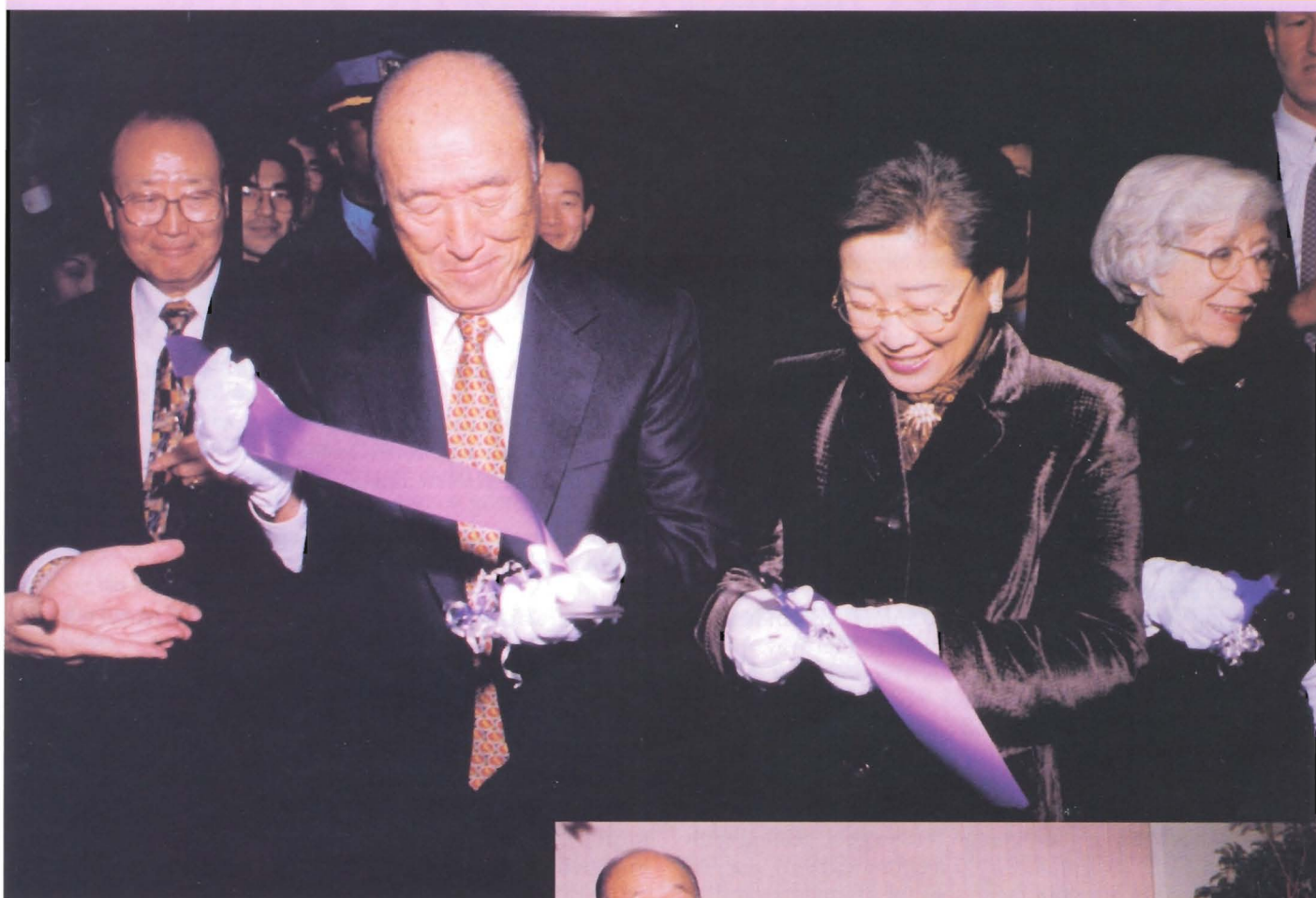
True Parents cut the ribbon at the inauguration of the Bridgeport University Health Sciences Center