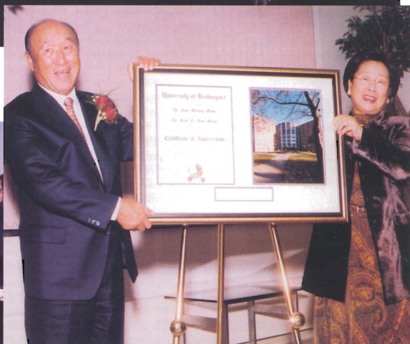
True Parents with a picture of the Health Sciences Center presented to them in recognition of their contribution towards its establishment