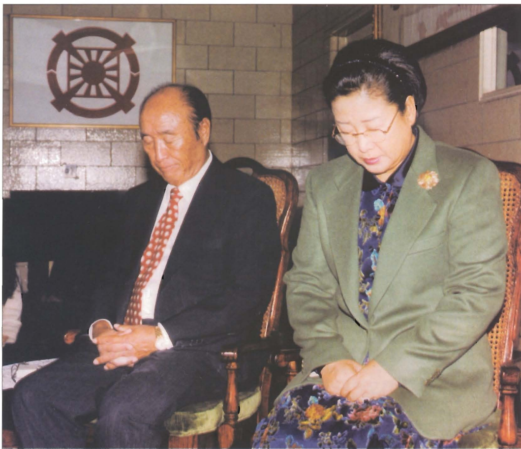
True Parents in prayer at the conclusion of the speech

All parts of our body symbolize some aspect of the universe. Human beings go through three stages—the water stage (mother's womb), the physical world and the spiritual world. Our head represents Heaven. Our mouth represents the water stage and also the horizontal. We breathe through our nose which is one step higher. Our nose represents the physical world and also Adam and Eve. God breathes through Adam and Eve. Without Adam and Eve, God cannot breathe. One more step up are the eyes, which represent God. The eyes keep looking, and God is looking for love—He has everything else. This is because love cannot be accomplished alone. No matter how absolute God is, He still needs to be one with His object.