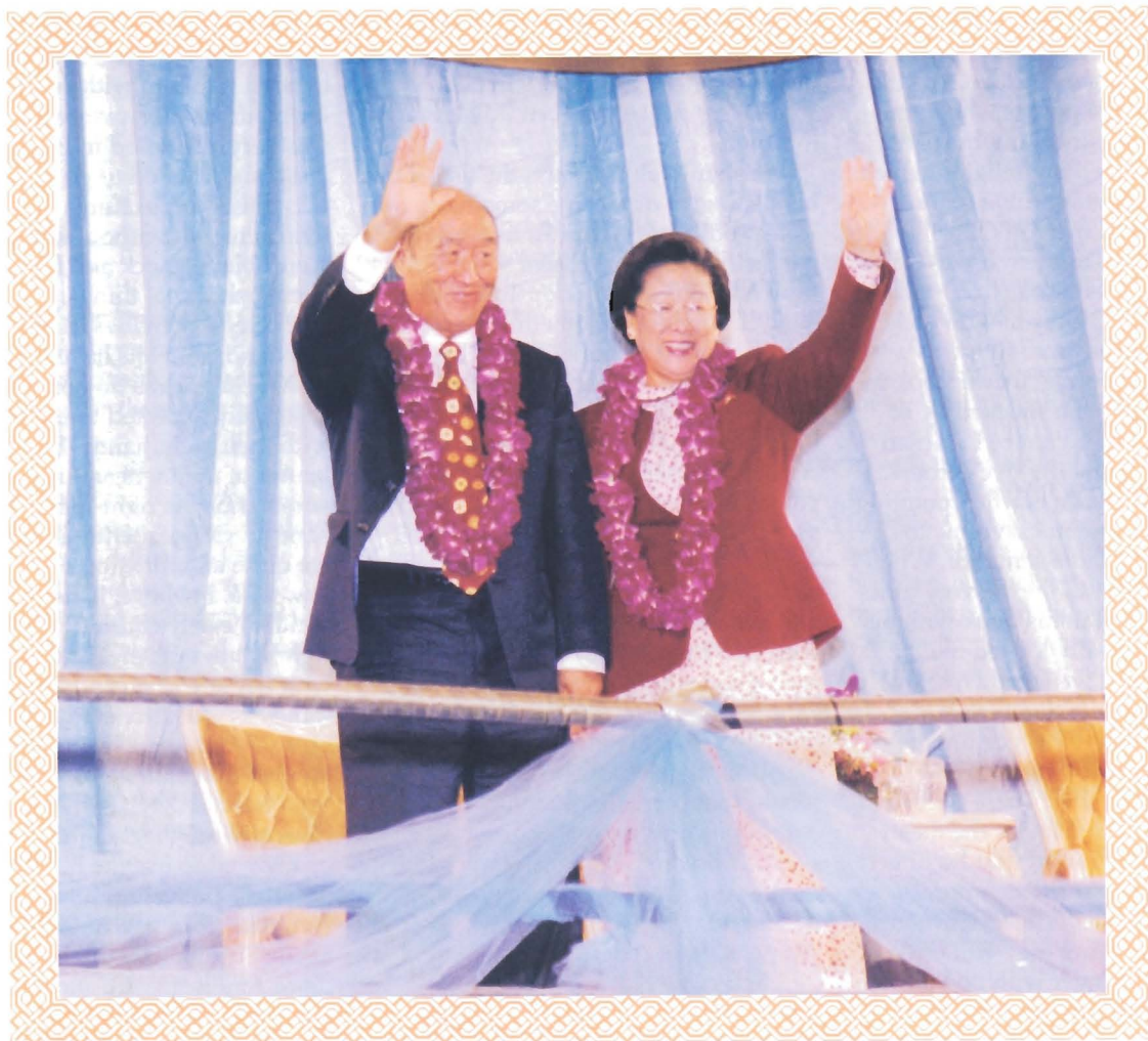
True Parents greet audience at evening program on True Children's Day; November 19, 1998 in New York