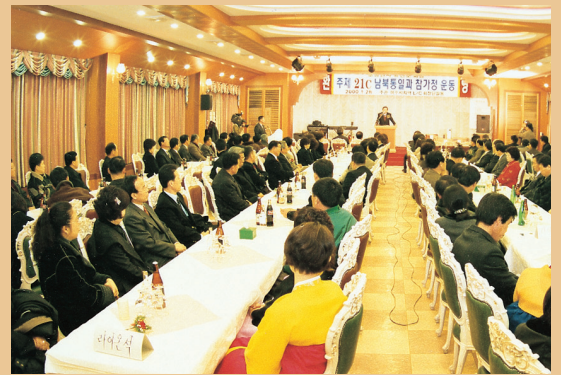
A presentation on "North-South Unification and True Family Movement for the 21st Century" at Yosu in the far south of the peninsula, Jan. 28