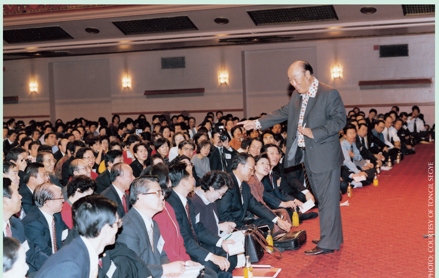
Father speaks to all assembled leaders and members at the January 3 meeting for leaders held in the Manhattan Center in New York

There must be an unbroken blood lineage where True Parents' tradition, the painful history of tears, sweat, and blood, is bequeathed to the descendants as their tradition and pride. You must take pride in the authentic, pure blood lineage. You must know that this is the era of the realm of the fourth Adam, when you can be