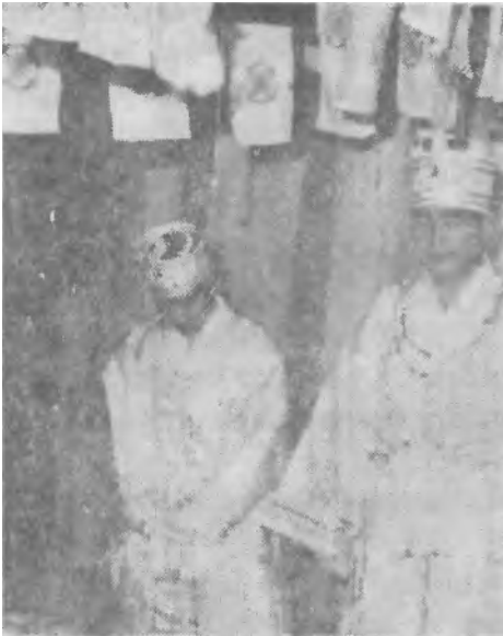
A scene of ceremony for God's Day

Now, we have greeted the New Year of 1970, and under the slogan of "we have to present victorious unified front". we must work for our Heavenly Father in this one year.