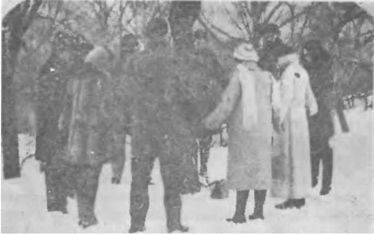
New York family at Holy ground