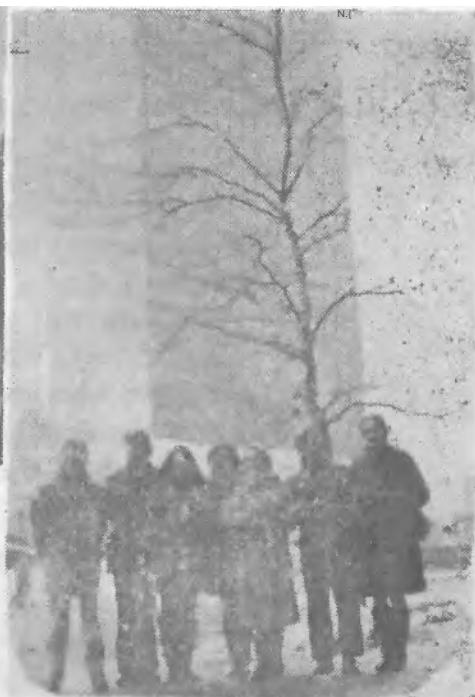
We Pick up where the U.N. leaves...