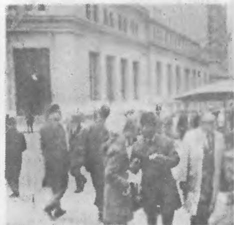
Wesley witnesses gigolo street