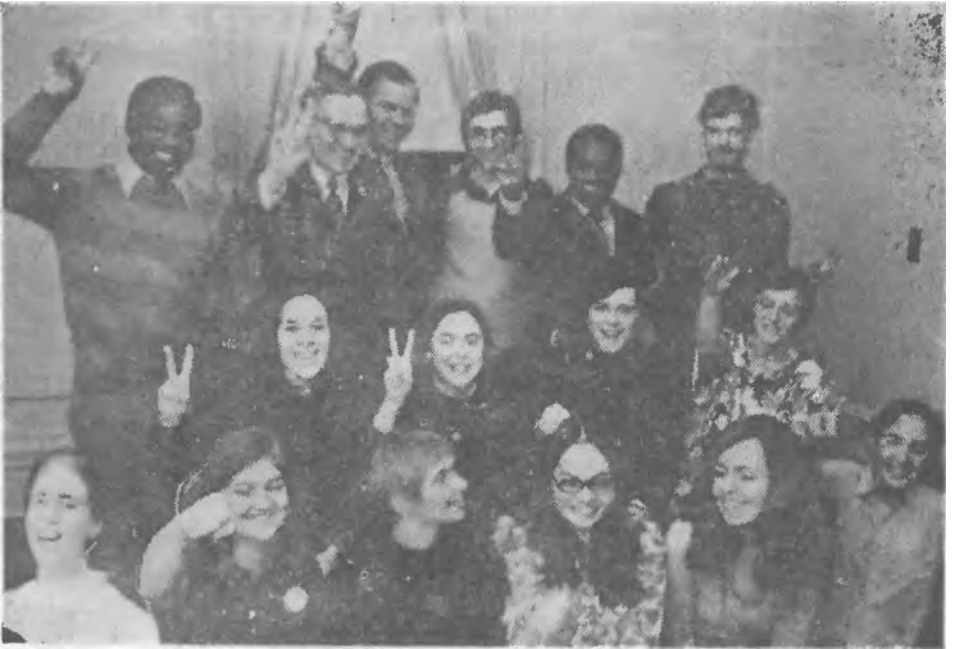
To gain a victory by New York Family

To give you an idea of the numbers here I'll quote some statistics; the population density of Manhattan is 73,839 people per square mile. This compared to 86,073 in Calcutta, 37,533 in Brooklyn, New York, 16,451 in San Francisco, and 12,442 in