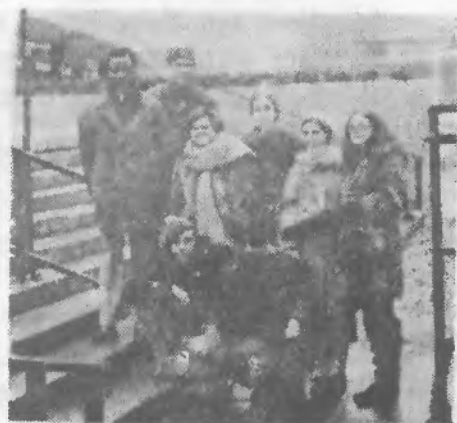
WITNESS IN New York