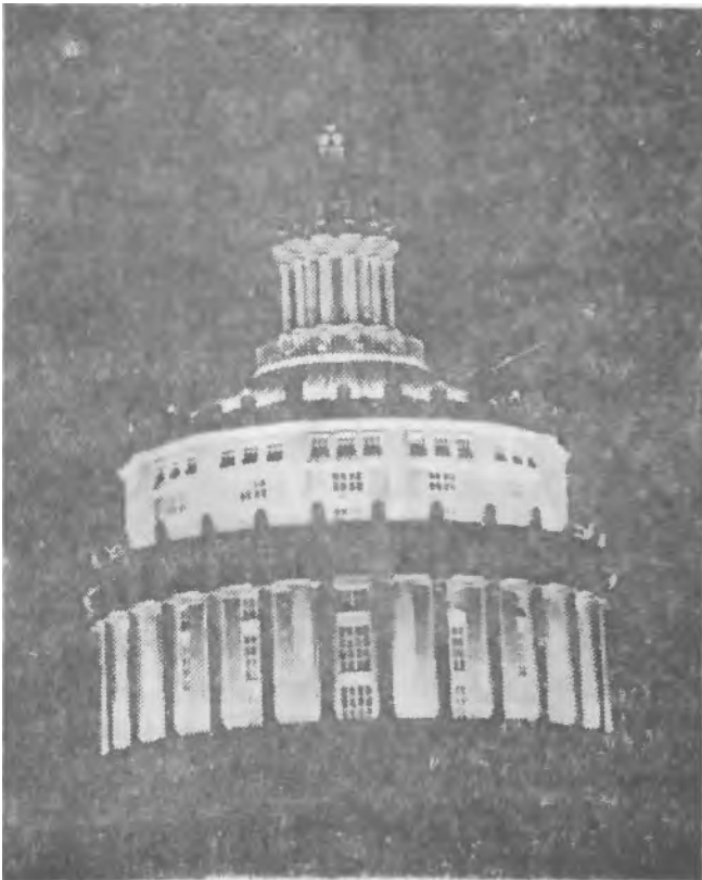
University of Rochester

As America's role in the world restoration is highly techno-