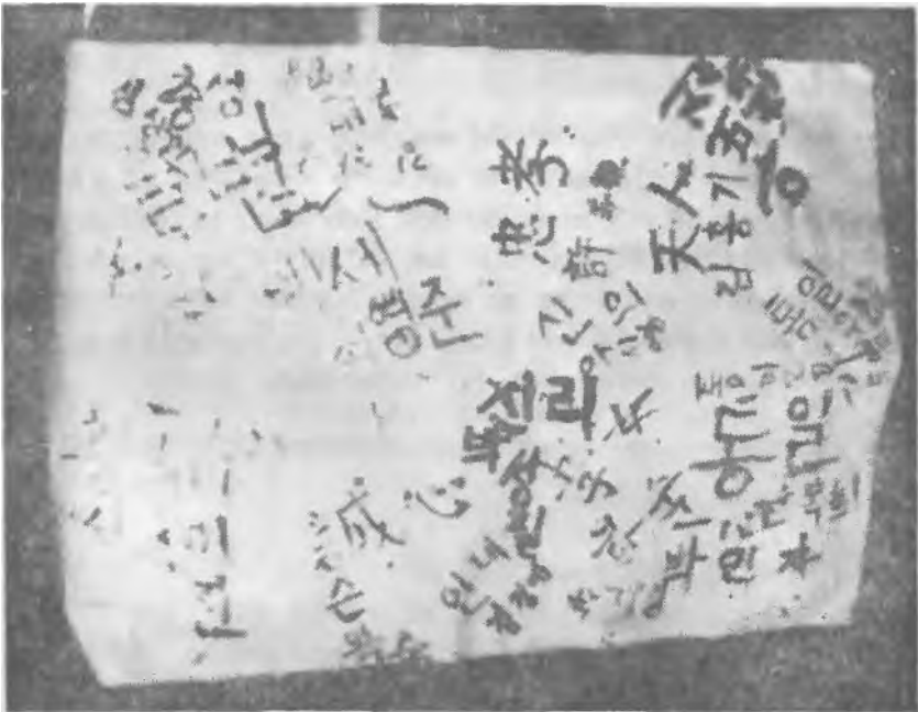
Writint) in blood by stuAent. of Suoci4emoon district in Sec./All

At the Headquarters of Suodaemoon (West Gate) in Seoul