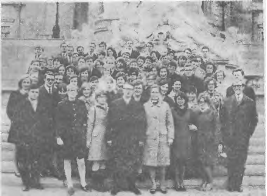
Children's Day 1970. Austrian Family

The most significant event in this month's activities of the Austrian family has been a radical change of policy regarding our university work. Our limitation to the religious approach and our ignorance in political matters had adverse effects on