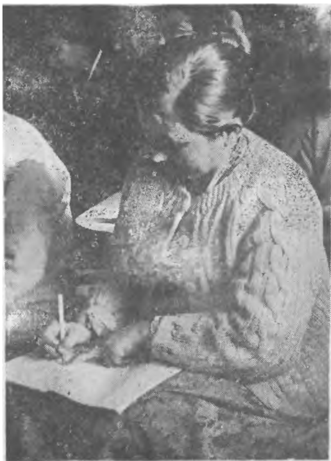
A mobilized woman member of blessed family

During the period between December 20th, 1970 and January 30th, 1971, All other family members, than blessed family members already mobilized for propagation till the end of 1970 started for propagation into the country, at all hazards.