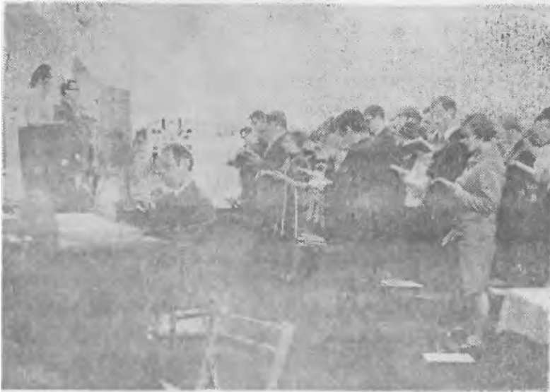
Second Annual European Conference, Essen, Germany In the Meeting Hall

more and more aware of the "signs of the time" so that from this point of view I have good possibilities to start a discussion. I could talk with many young girls and boys either on the street or in groups or at home, and feel happy about every positive conversation and every sign of confidence, because confidence is most important for winning people. There are especially three