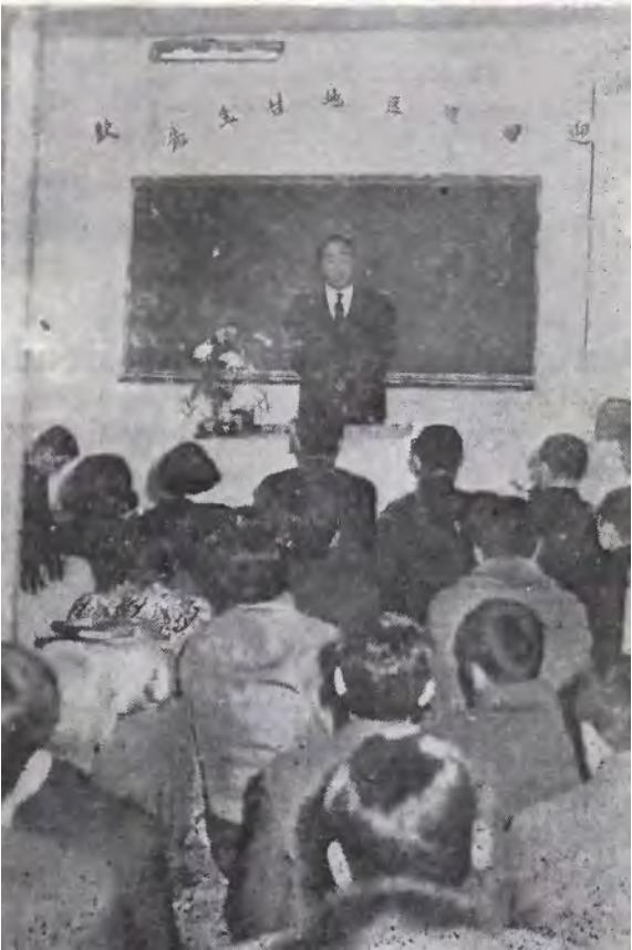
Master addresses at Yongdungpo District

Shortly after Master finished his round visit to 24 local districts for twelve days last January, he again paid a round visit to all headquarters of 10 districts in Seoul for 9 days from