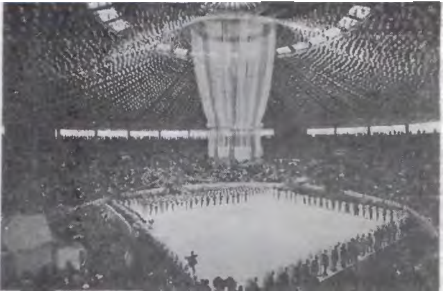
A panoramic view of 777 Couples Wedding ceremony

This was the day we were all waiting for. We got up and dressed in our wedding suits and ate breakfast about 8:40 a.m. boarded the bus for the journey to the Seoul Chang Chung