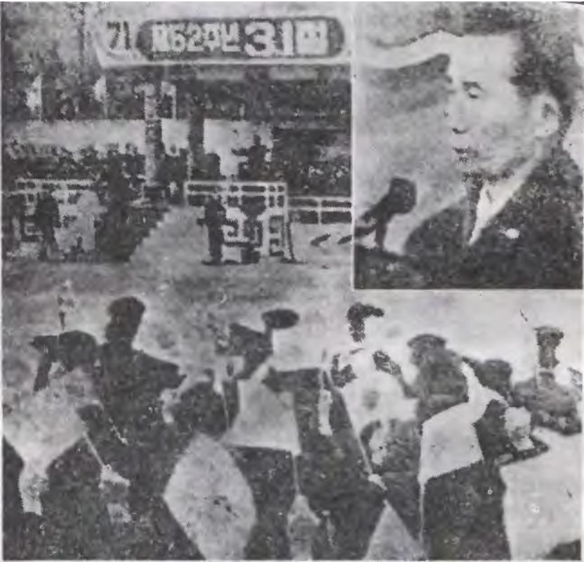
President Park Chung Hee delivers a Commemorative address during a ceremony held at the Capitol plaza.

The celebrating ceremony of the 52nd anniversary of the Sarnil (March 1) Independence Movement was held at the Capitol plaza March 1st, 1971. Over 10,000 people took part in