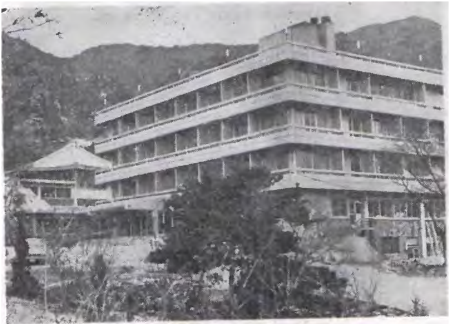
Christian Academy House

Under the auspices of the Collegiate Association for Research of Principles, the 2nd Principle Seminar for professors opened at Christian Academy House with the presence of 88 professors