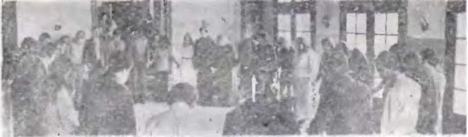
Los Angeles Family praying before going out to witness