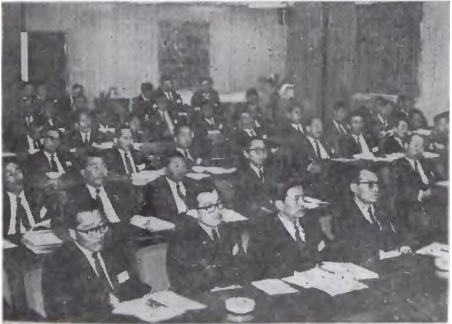
Professors hearing the lecture of Principle

World. This has to also overcome Nihilism that is not solved by Existentialism in this age. Therefore, we need a new styled religion and I believe that this could be done by the Principle of Creation in the Divine Principles, doctrine of the Holy Spirit Association for the Unification of World Christianity.