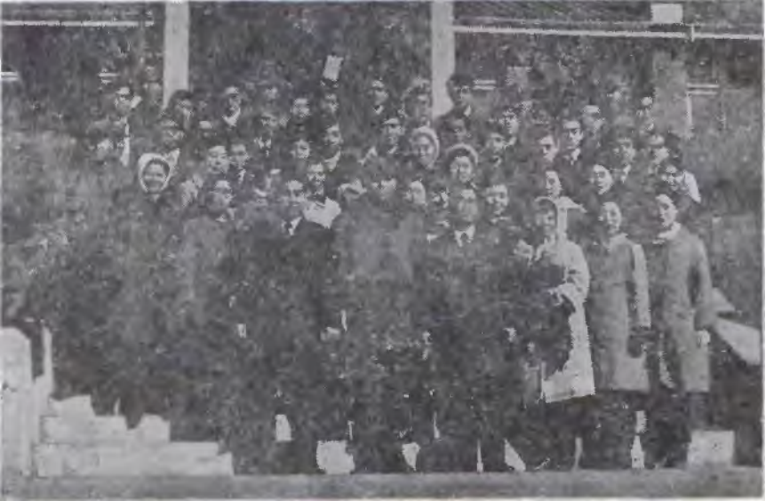
Japanese members with officers in front of Hq, Division

Anti-communist Hall, they who have studied communism logically had come to realize the brutality of north puppet regime of Communists having study of the exhibition of north Korea's