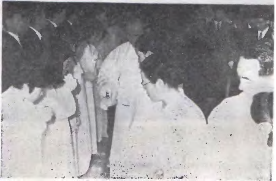
A Scene of Holy Wine Ceremony

On Sunday, October 18, ! we had [barely gotten to sleep when at 12:45 a.m. we were awakened with the news that the Master was on his way from Seoul and that he wanted to perform the Sacred Wine Ceremony when he arrived. Everyone