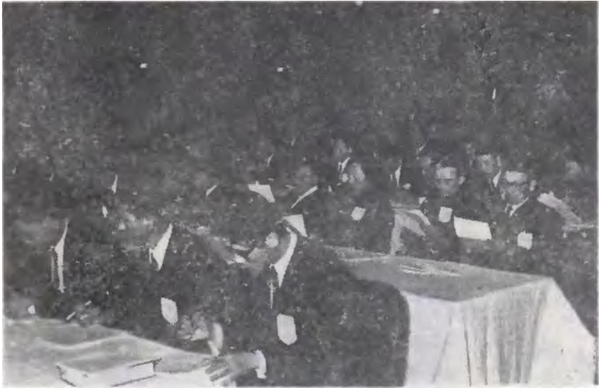
Pastors of established Churches hear Divine Principle