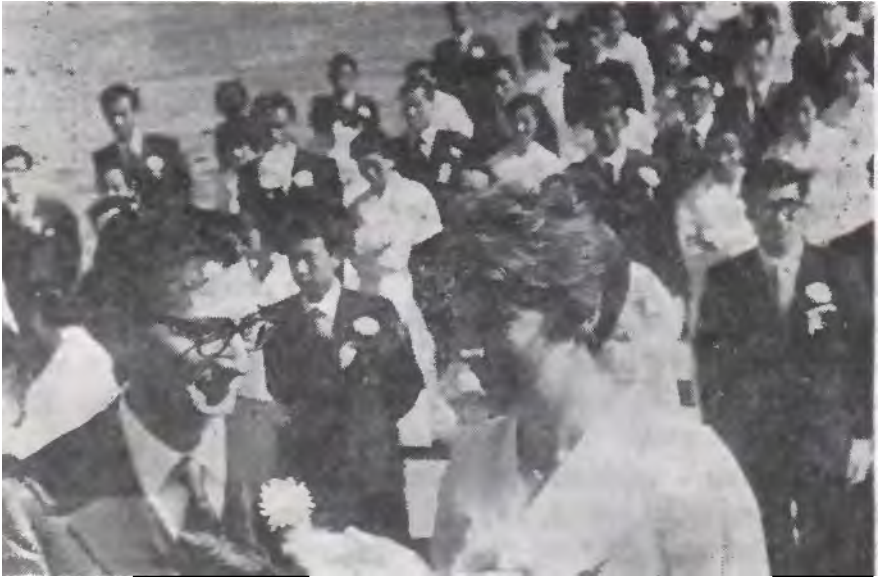
A couple of Western blessed Families