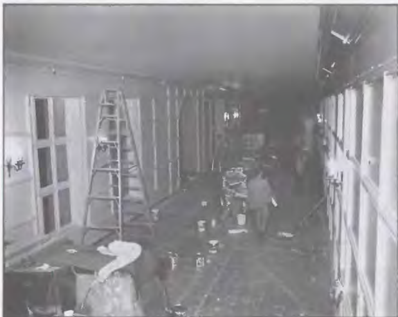
Spacious lobby required 100 man-days to paint.

The fourth, fifth, and sixth floors are lined with small rooms,