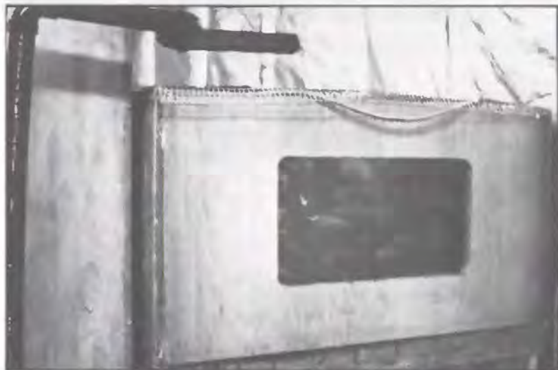
A tank like this could produce five pounds of fish per cubic foot of water in your basement.

The "solar kitchen" that converts the sun's rays into heat for