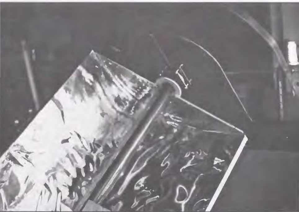
This solar collector produces enough heat to boil water in the coffeepot at rear.

cooking was designed by a group member who was formerly the senior design engineer for the Atlas missile propulsion system. He is also working on a solar collector for home water heating that could be easy and cheap to build by local individuals or cooperatives.