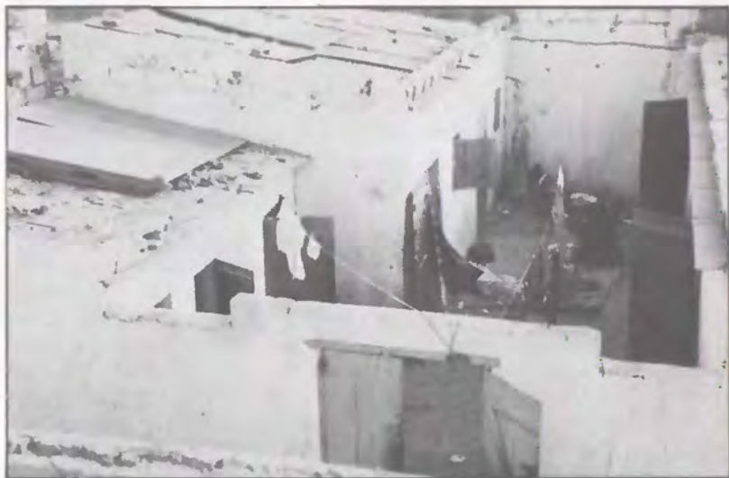
Top: Courtyard of house at left where our Mauritanian missionaries live. Center: Iron mine at Tazadit. Bottom: Mauritanian nomads and their camels.