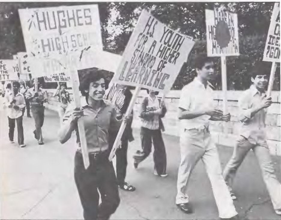
High school youths in New York City, members of the International Family Association, demonstrate in favor of a value-oriented high school curriculum.

signing social roles for youth and reshaping some of the institutional structures within which youth move to adulthood.”