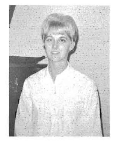
...and everybody else --