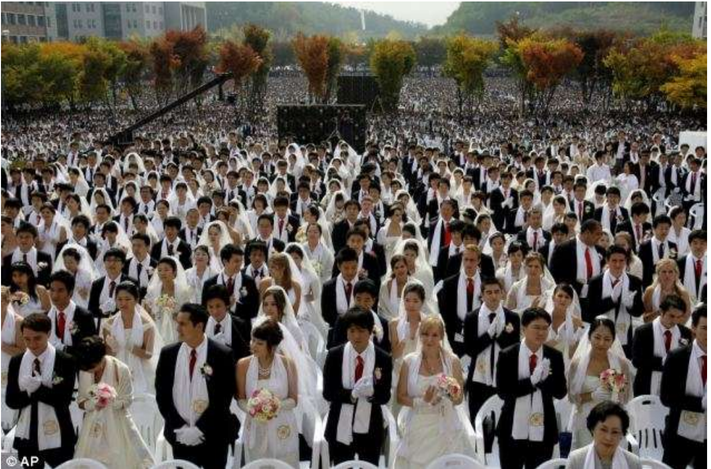
Mass nuptials: Couples from around the world participate in a mass wedding ceremony arranged by the Rev. Sun Myung Moon's Unification Church at Sun Moon University in Asan

His wife remains the symbolic head of the mission that oversees the entire Tongil, Korean for 'Unification' group.