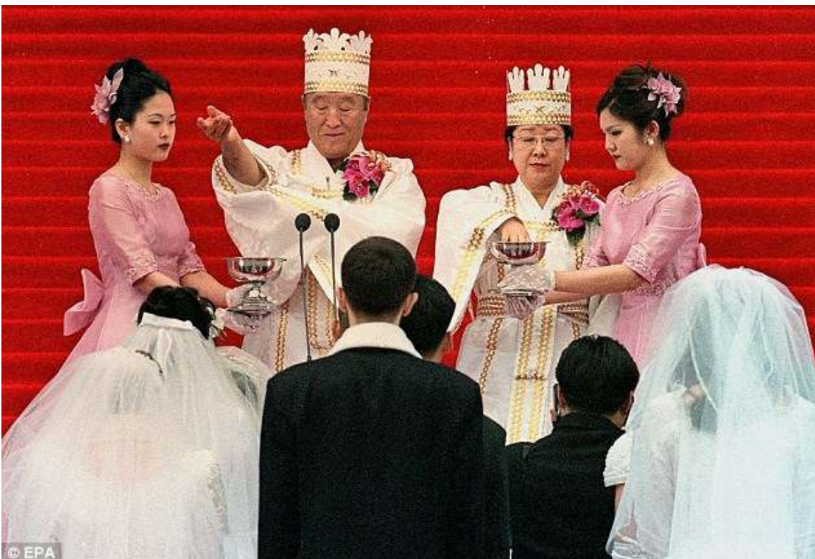
Blessing: Moon and his wife bless the brides and the grooms in a mass wedding ceremony at Chamsil Olympic Stadium in Seoul in 2000

The church he founded is now run by his youngest son, while the business entities are run by another son.