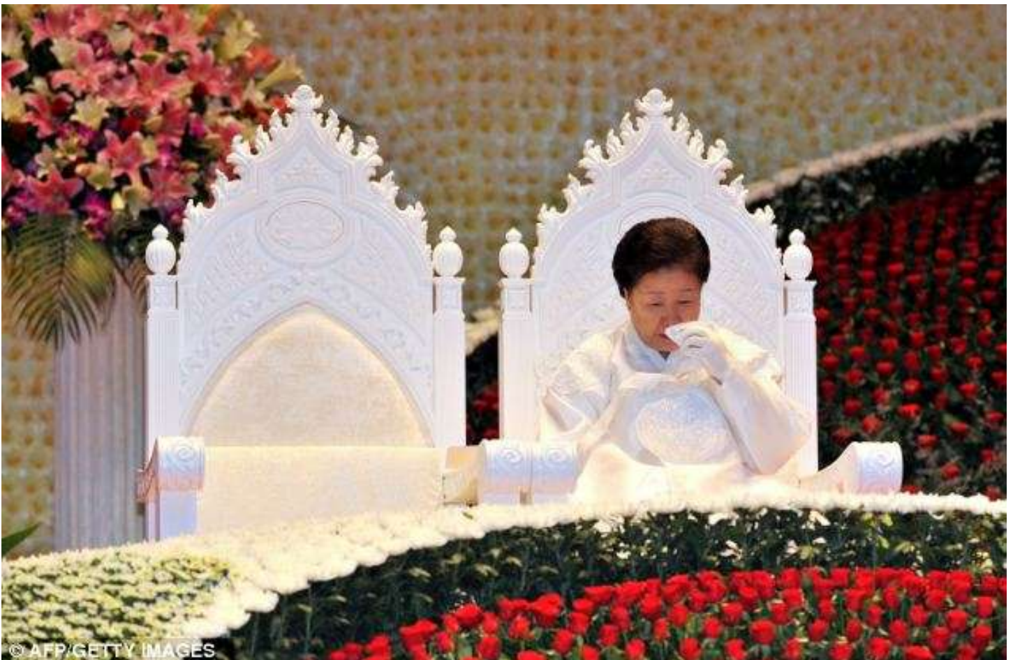
Grieving: Han Hak Ja, wife of late Unification Church founder Sun Myung Moon, weeps during his funeral ceremony. His wife remains the symbolic head of the mission that oversees the entire Tongil, Korean for Unification group

Many sobbed quietly as the cortege carried Moon's red-and-gold casket to the altar inside a vast hall in the church complex.