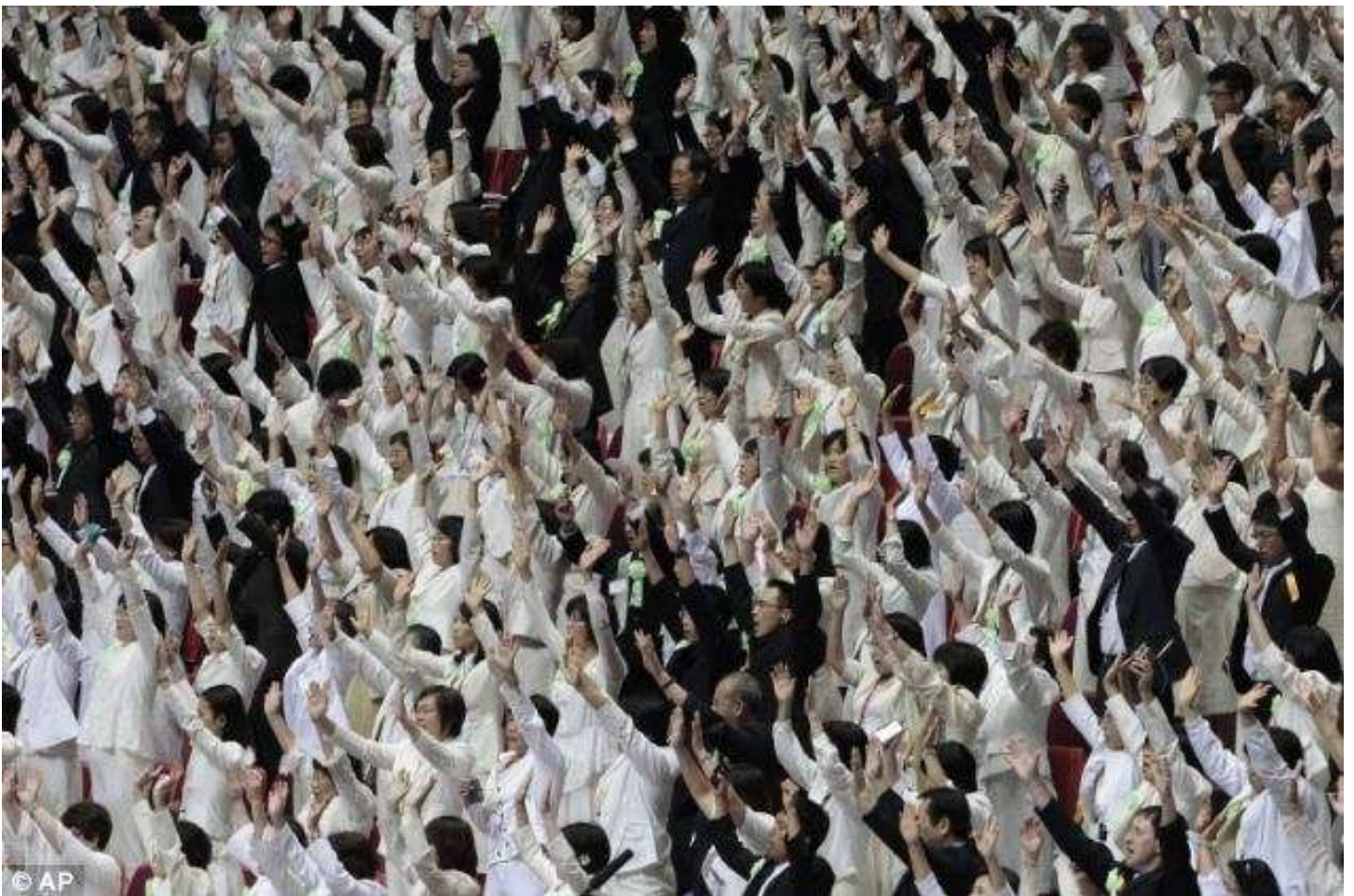
Well-wishers: A packed crowd watched as the casket carrying Sun-Myung Moon, the late founder of the Unification Church, was carried at the CheongShim Peace World Center in Gapyeong, about 60 km (37 miles) northeast of Seoul