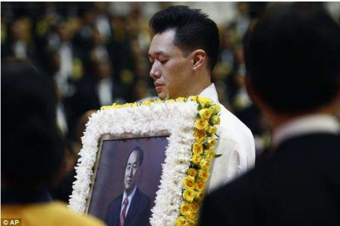
Mourning: A family member carries a portrait of late Rev. Sun Myung Moon - he built a multibillion-dollar business empire stretching from the Korean Peninsula to the United States