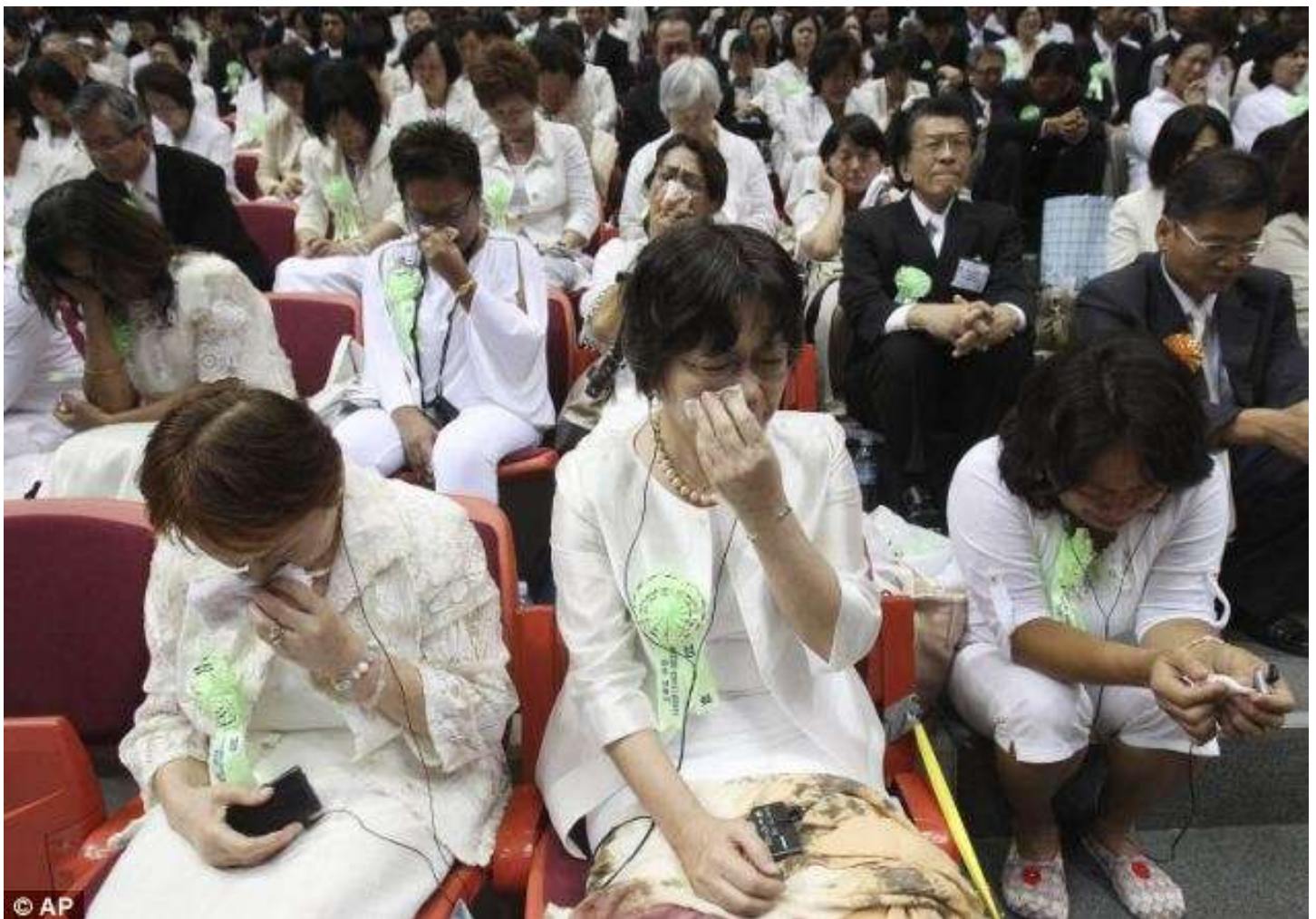
Weeping: Men dressed in black suits with white ties and women in white or ivory dresses for the ceremony. Many sobbed quietly as the cortege carried Moon's red-and-gold casket to the altar inside a vast hall in the church complex