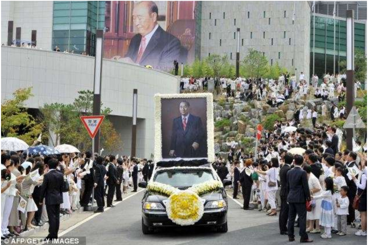
Crowds: A funeral car loaded with a portrait of the late Sun Myung Moon drives past followers after his funeral ceremony

Many mourners wept as a top church official said in a speech that Moon was moving into a spiritual world after completing the messianic role that God had asked of him.