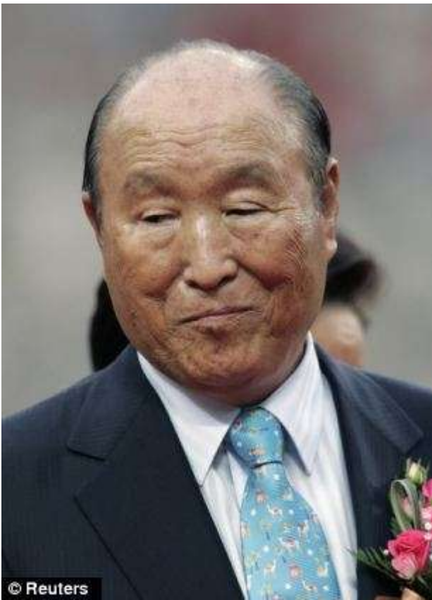
Moon started the church after claiming Jesus appeared to him while he was praying as teenager