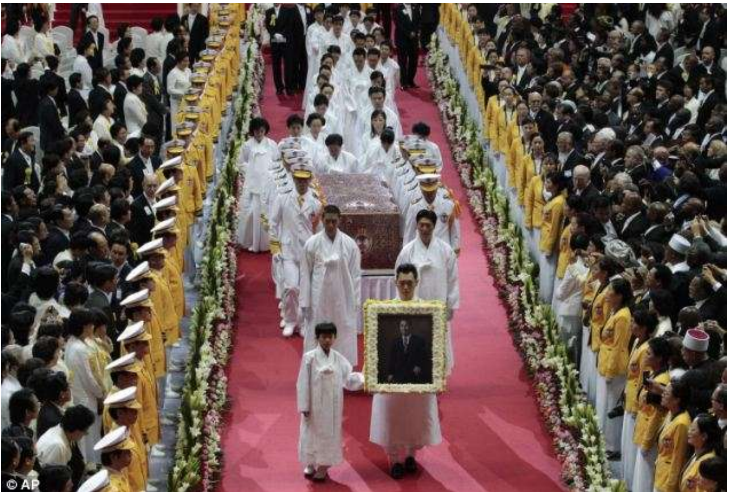
Red roses: Flowers were a central theme of the service and single red roses encased in cellophane were handed out to mourners