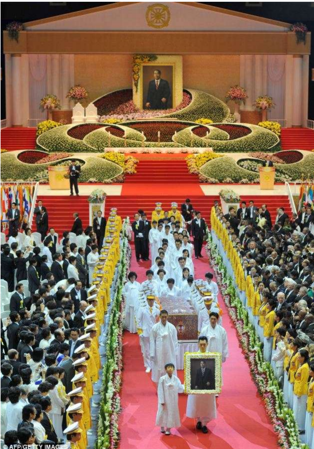
Remembrance: More than 30,000 mourners, many weeping openly, attended the elaborate, flower-strewn funeral in South Korea