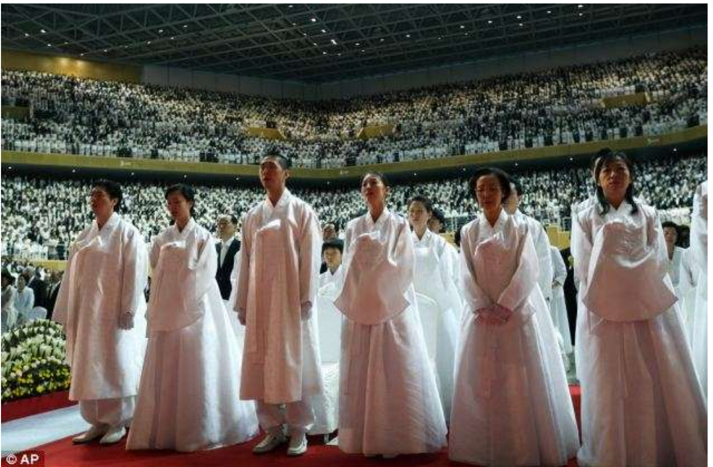
Popular: Those who could not get into the service watched on live broadcasts around the campus