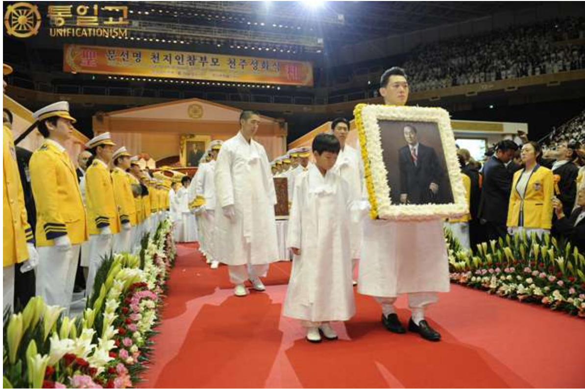
True Parent Leaving the Venue

'Sun Myung Moon, the True Parent of Heaven, Earth and Humankind; the Universal Sung Hwa Ceremony' a first and last of its kind, was grandly concluded amidst the blessings, conditions and love of many people. Even though the tears we shed on this day were tears of sadness, let us all become Unificationism members who can shed precious tears in determination to realize God and True Parents' will more strongly than ever before realizing that True Father is even closer to us now.