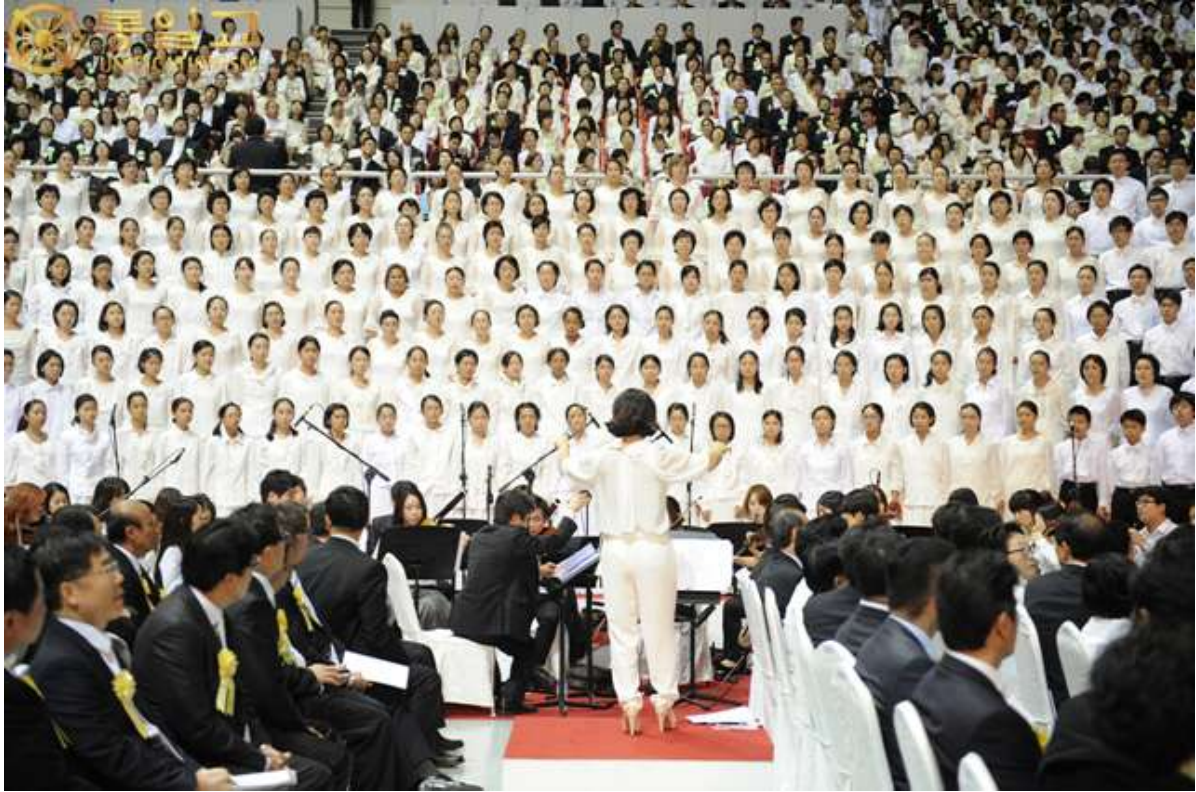
The 340 Singers in the Korea-Japan Joint Chorus Singing