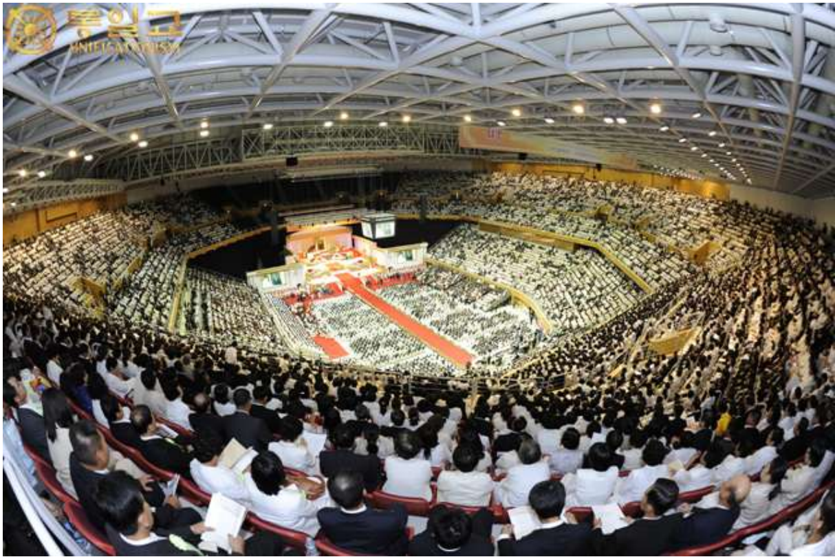
Thousands of People gathered in Cheong Shim Peace World Center