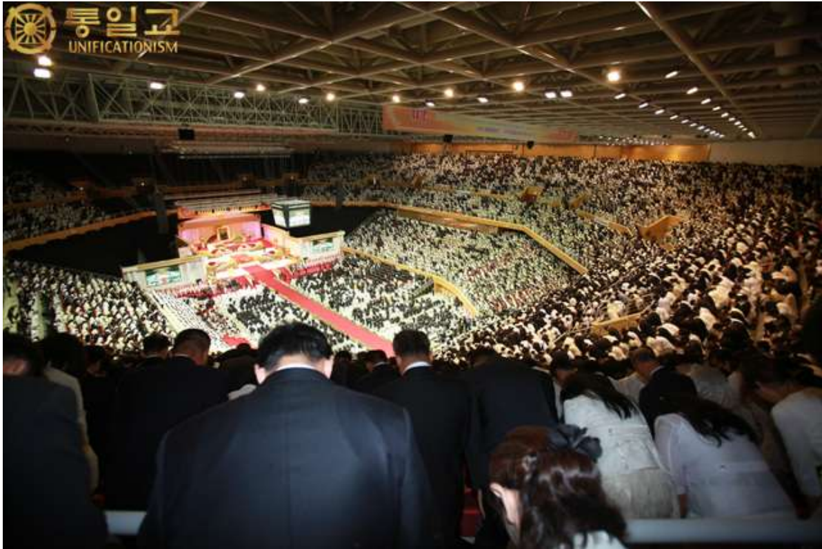
Participants Offering Bows to True Parent