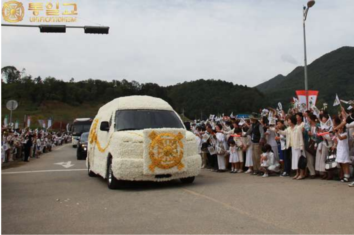
The Holy Body of Sun Myung Moon, the True Parent of Heaven, Earth and Humankind Moving to the Won Jun Burial Site