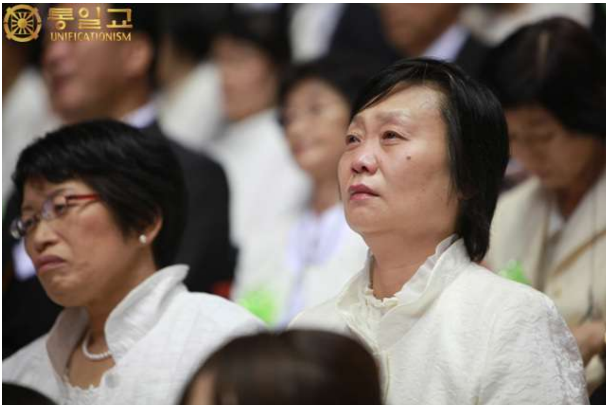
Participants Listening to the Hymns

After praise by the chorus, True Mother presented flowers to Sun Myung Moon, the True Parent of