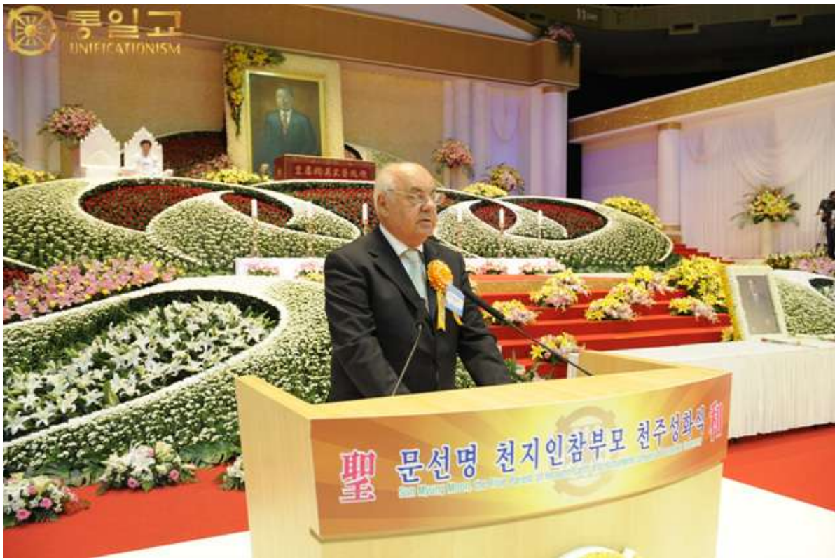
Eulogy by the Former President of Albania H.E. Alfred Moisiu