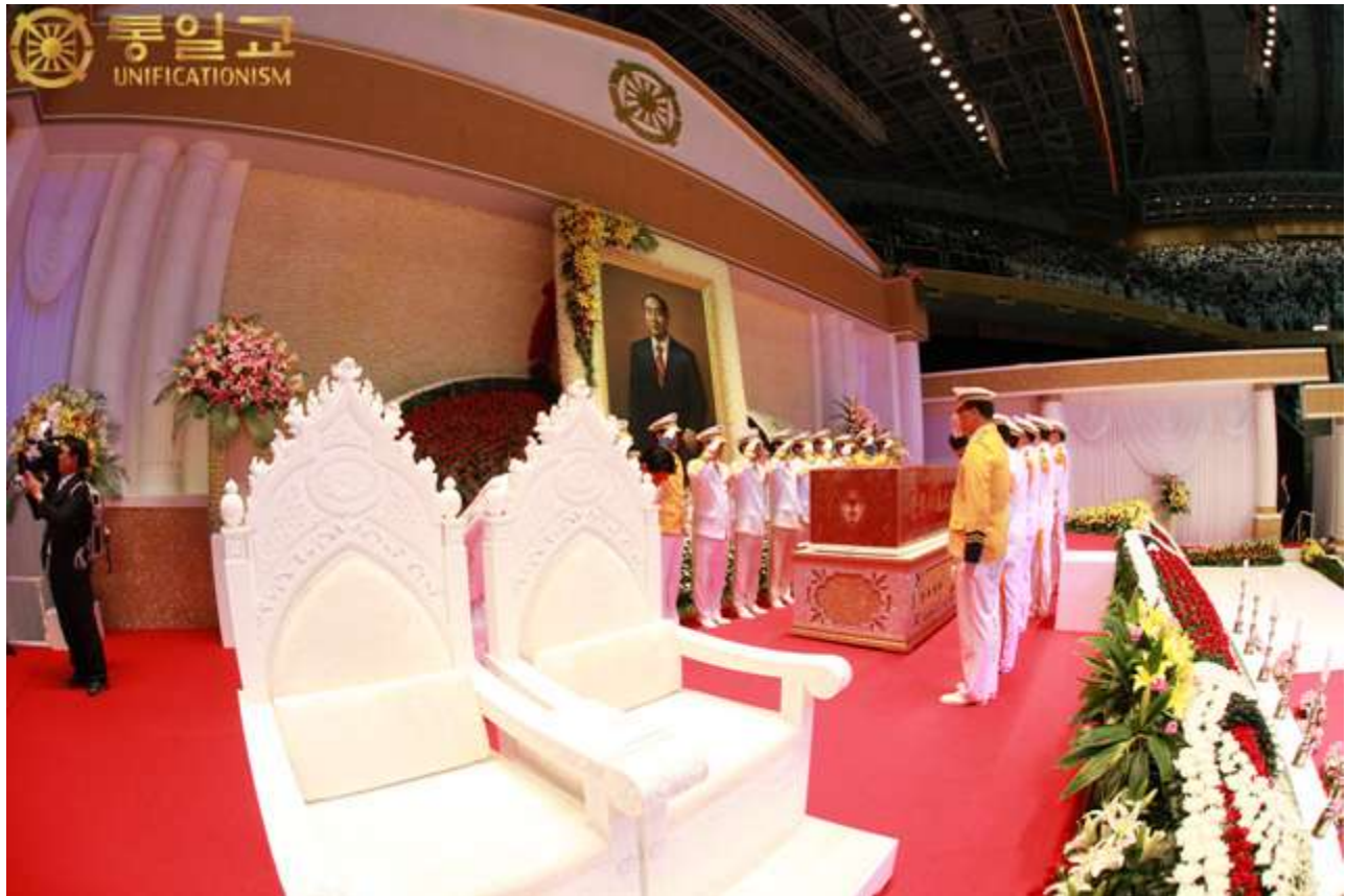
The holy body of Sun Myung Moon, the True Parent of Heaven, Earth, and Humankind entering the Universal Sung Hwa Ceremony venue, Cheong Shim Peace World Center

The holy body of Sun Myung Moon, the True Parent of Heaven, Earth and Humankind left the Cheon Jeong Gung Museum at 9:20 and arrived at the Universal Sung Hwa Ceremonial Hall at Cheong Shim Peace World Center at 10 o'clock. Attendants consisting of 40 second generation couples made an entrance and pallbearers kept steps as they carried the holy body of the True Parents of Heaven, Earth, and Humankind all the way to the stage. Once it was done, the actual 'Sun Myung Moon, the True Parent of Heaven, Earth, and Humankind; the Universal Sung Hwa Ceremony' started. After the opening declaration and the Cheon Il Guk National Anthem was sung, the Korean Cultural Foundation Chairman Dr. Bo Hi Park gave the report prayer. Dr. Bo Hi Park's sincere prayer moved the hearts of participants to tears and soon the whole venue was filled with the sound of weeping.