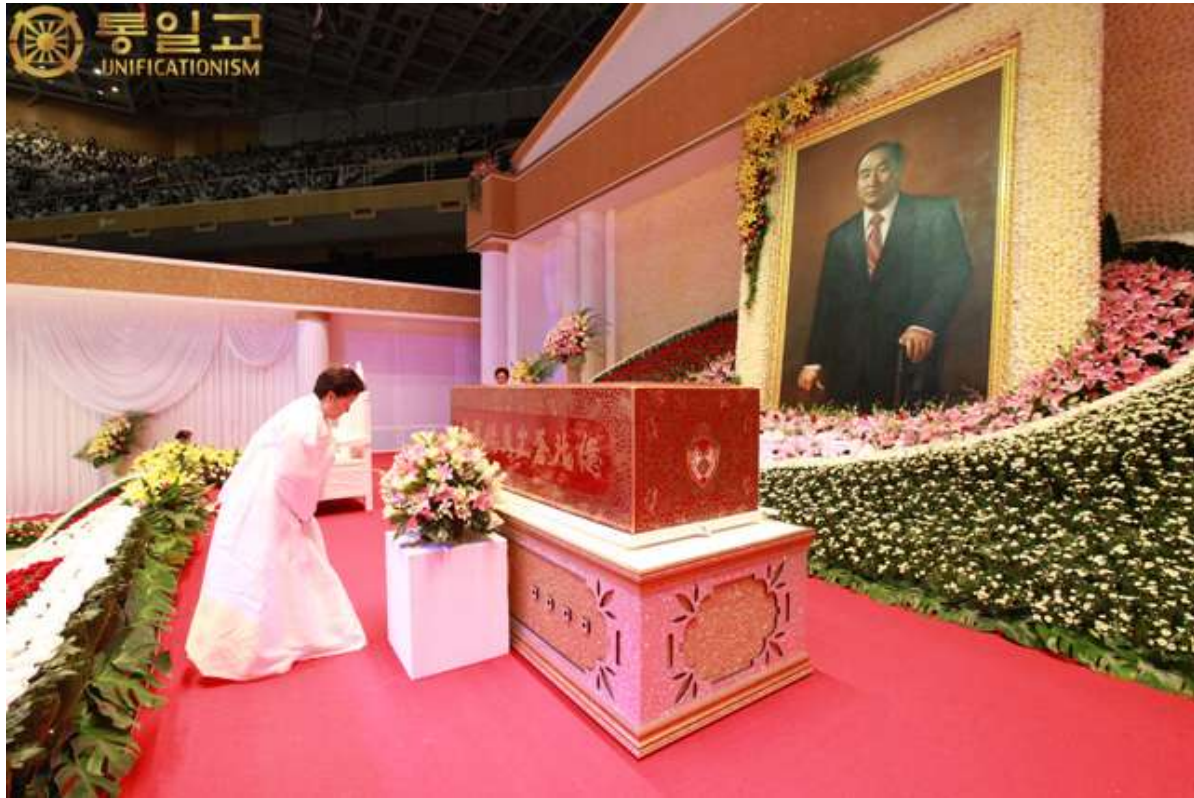
True Mother Presenting Flowers to Sun Myung Moon, the True Parent of Heaven, Earth, and Humankind

Heaven, Earth, and Humankind and was followed by True Family, the five great saints, representatives of second generation families, and lastly by representatives from different groups.