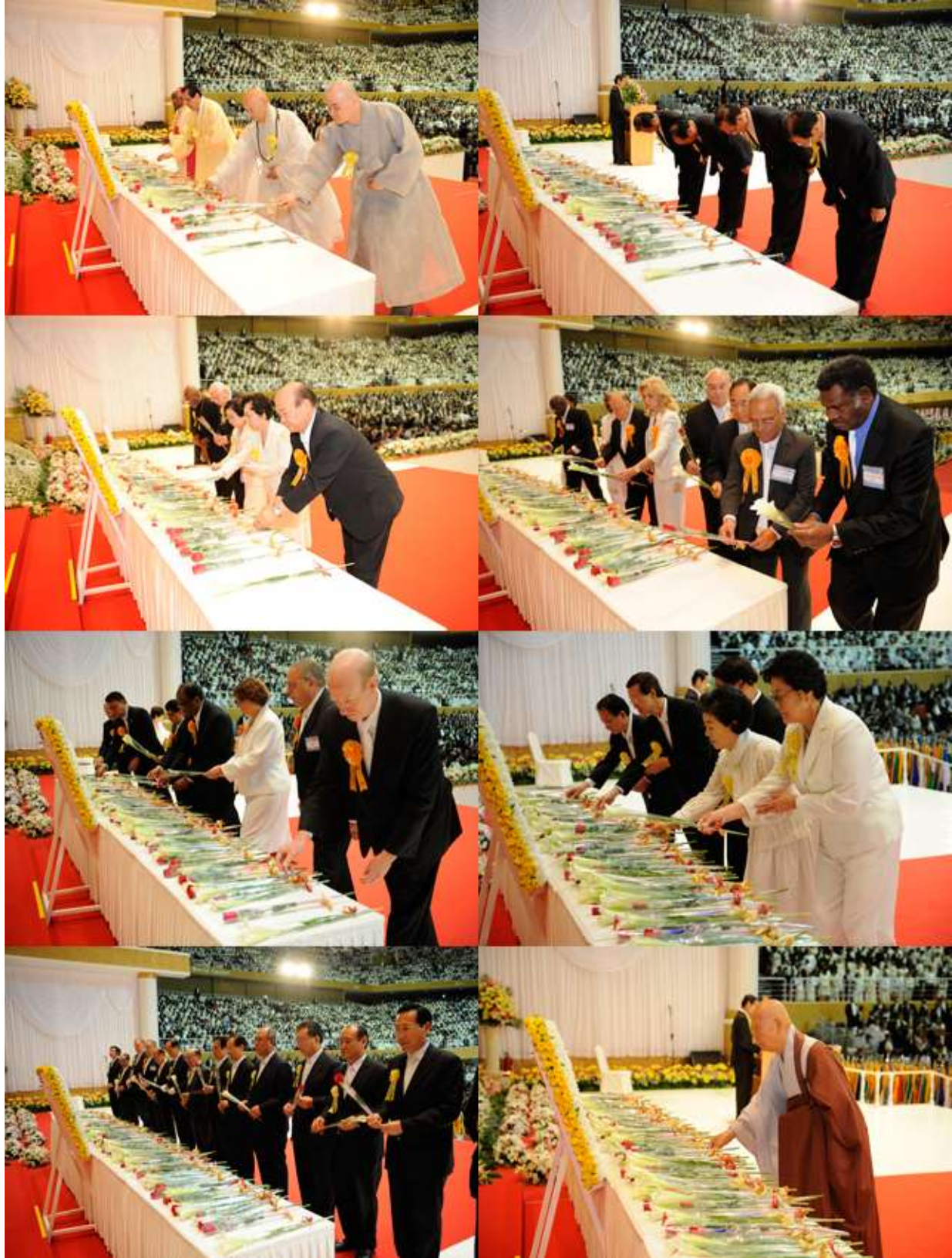
True Family and Representatives of Different Groups Offering Flowers