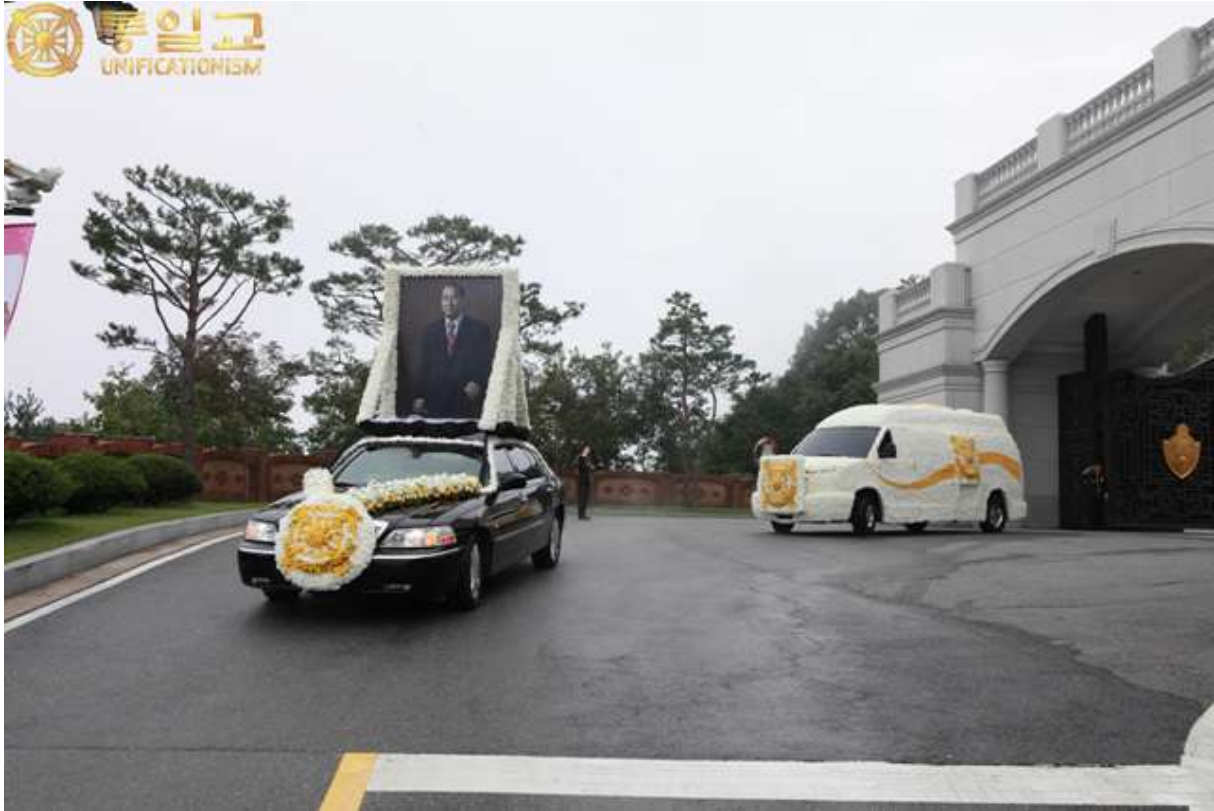
The holy body of Sun Myung Moon, the True Parent of Heaven, Earth, and Humankind leaving Cheon Jeong Gung Museum