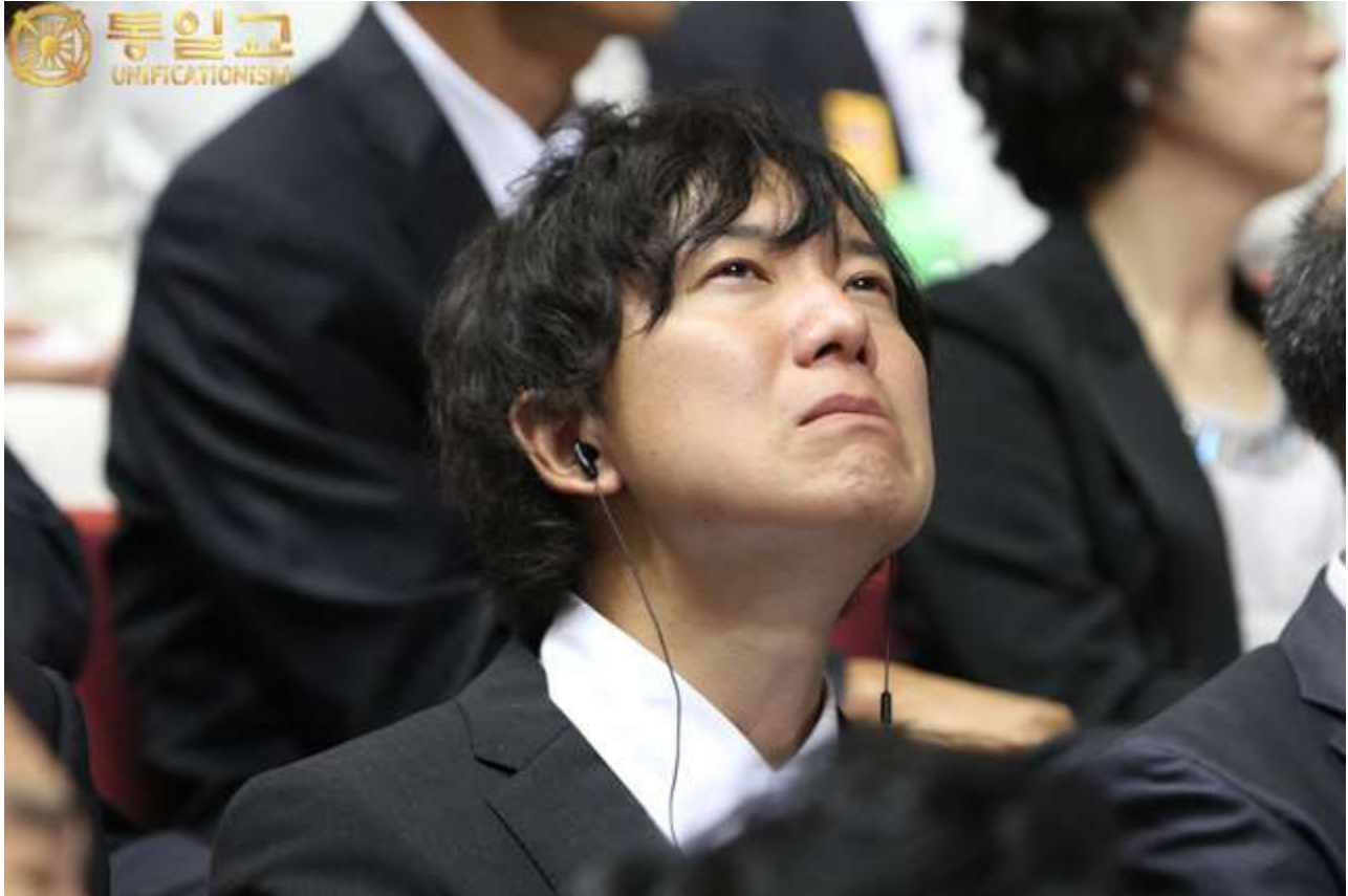
Participants Watching the Video on the Life and Accomplishments of True Father