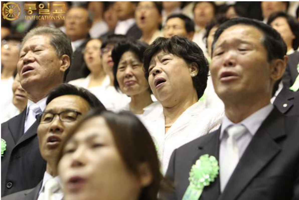
Participants Singing the Cheon Il Guk National Anthem