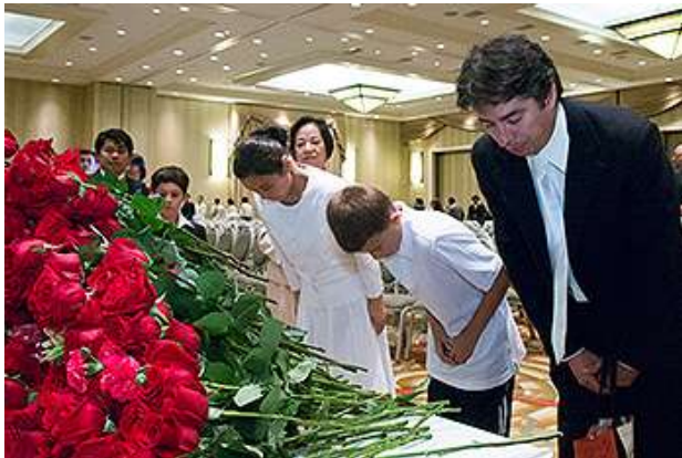
Many families brought children for the historic observance in a town close by to the East Garden residence of Father and Mother Moon.