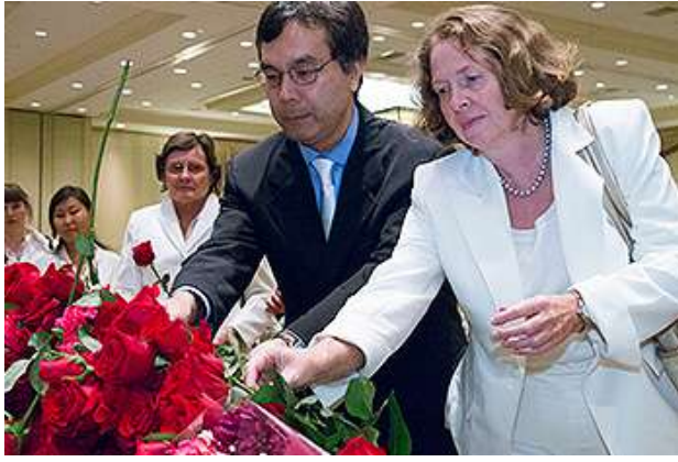
Each of the participants place a rose on the altar for the man known the world over as "True Father."