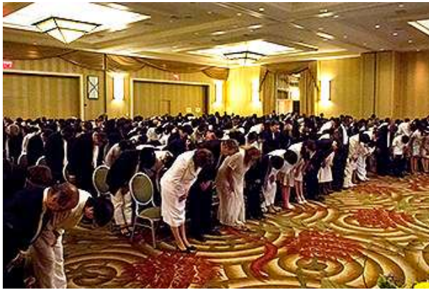
The congregation bowed to the man whose life's work defined their life of faith for decades.