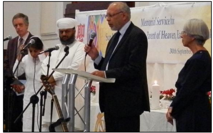
Music Ministry band – Interfaith representatives