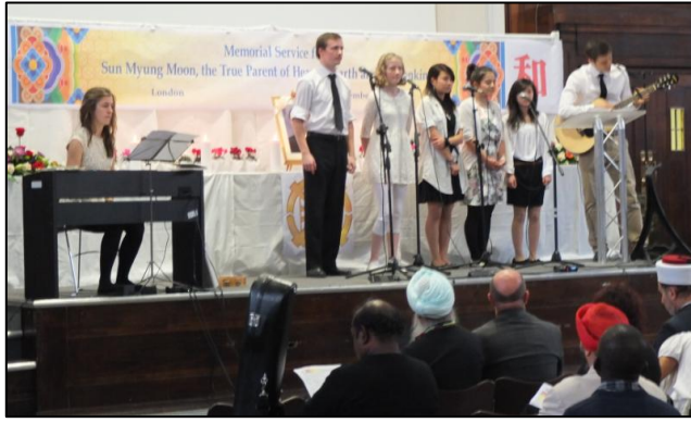
Youth in Harmony – South London Community band